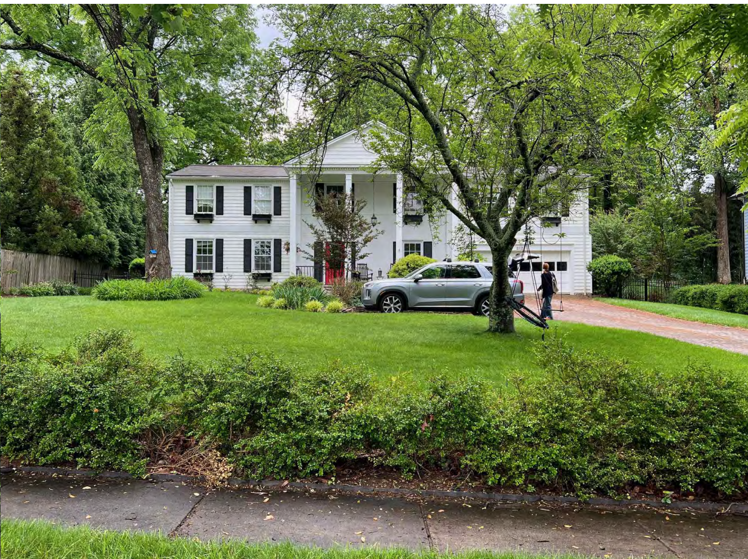
3 EXISTING FRONT ELEVATION, STREET VIEW