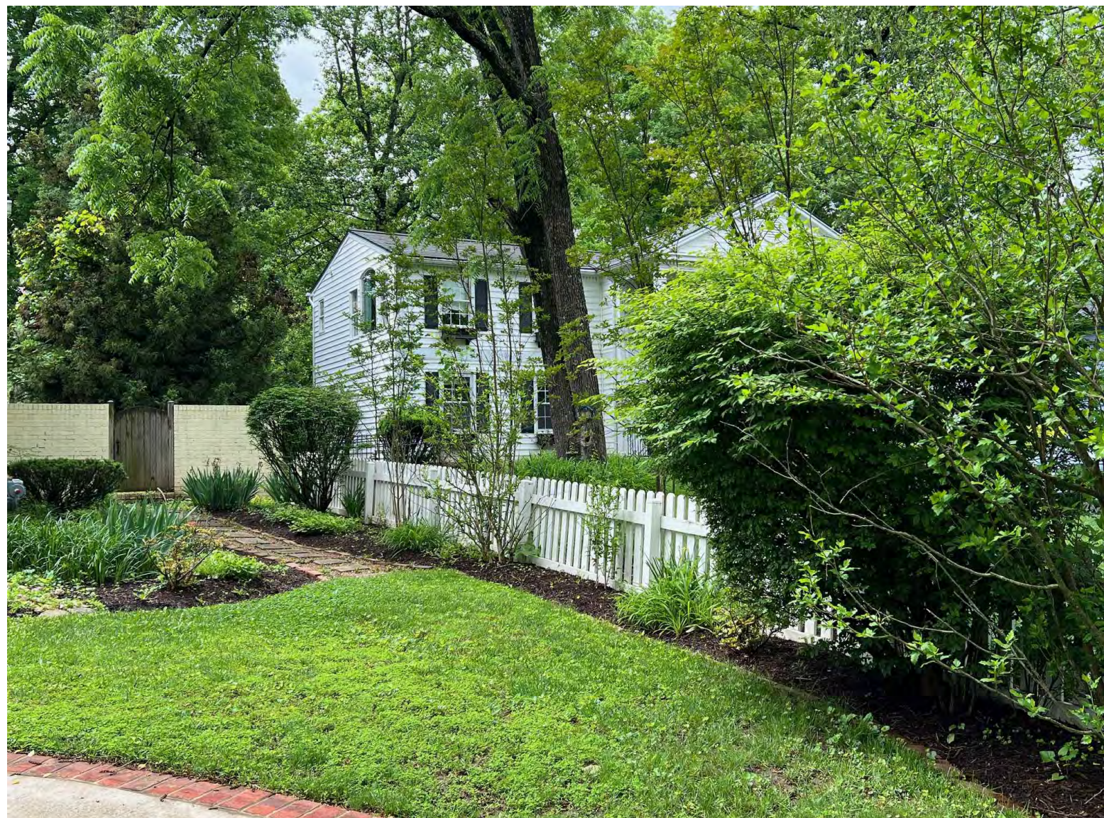
2 EXISTING LEFT SIDE ELEVATION, STREET VIEW