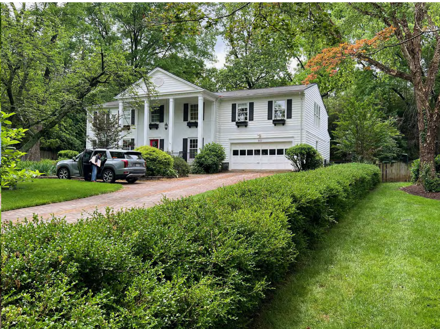
4 EXISTING RIGHT SIDE ELEVATION, STREET VIEW