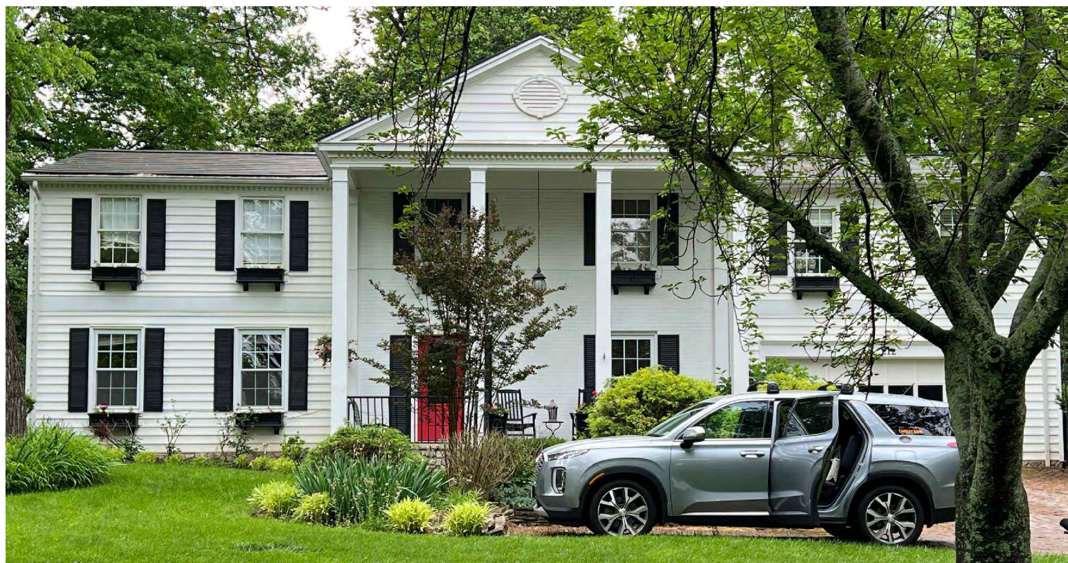
5 EXISTING FRONT ELEVATIONS, CLOSE-UP VIEWS