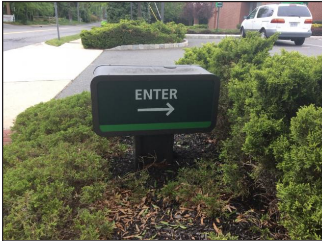
ORIGINAL PHOTOGRAPH - SIDE A