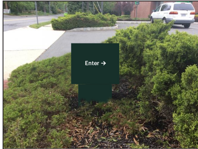
COMPOSITE PHOTOGRAPH with PROPOSED SIGNAGE