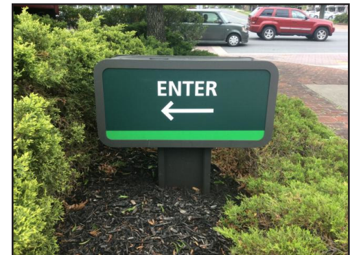
ORIGINAL PHOTOGRAPH - SIDE B

Non-illuminated painted directional sign with film decorated sign face. Aluminum tube frame and aluminum sheet construction. Sign to be painted to match: PMS 5535 #MP62874V1.0 (Satin Finish). Sign face first surface film 3M 5000 Scotchlite Reflective White Vinyl and 3M IJ680-10 Scotchlite Reflective Film (InkJet Digital) to match Matthews Pantone 361 with 3M MCS approved inkjet inks.