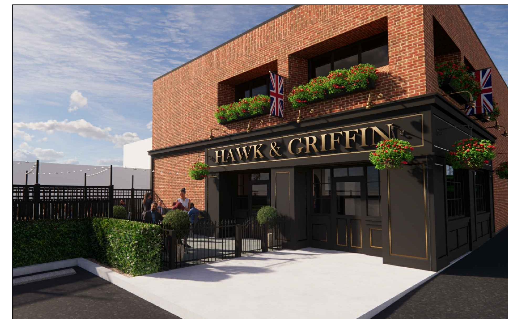
PROPOSED BUILDING STOREFRONT