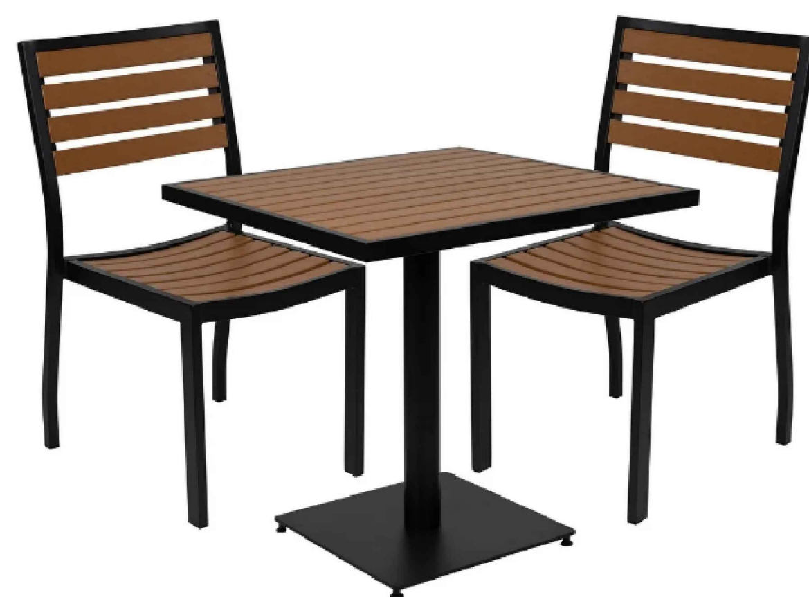
SIMULATED TEAK OUTDOOR DINING SET