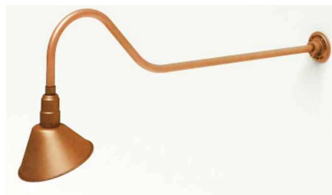
GOOSENECK LIGHT FIXTURE