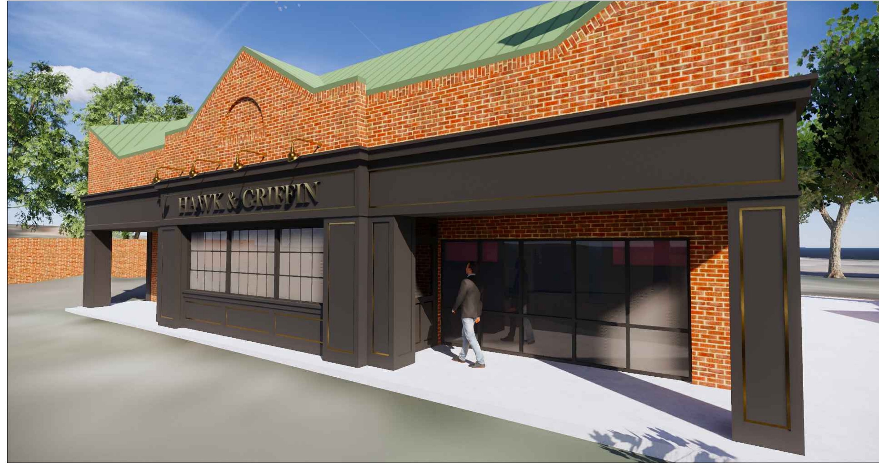
2/A3 MAIN ENTRANCE