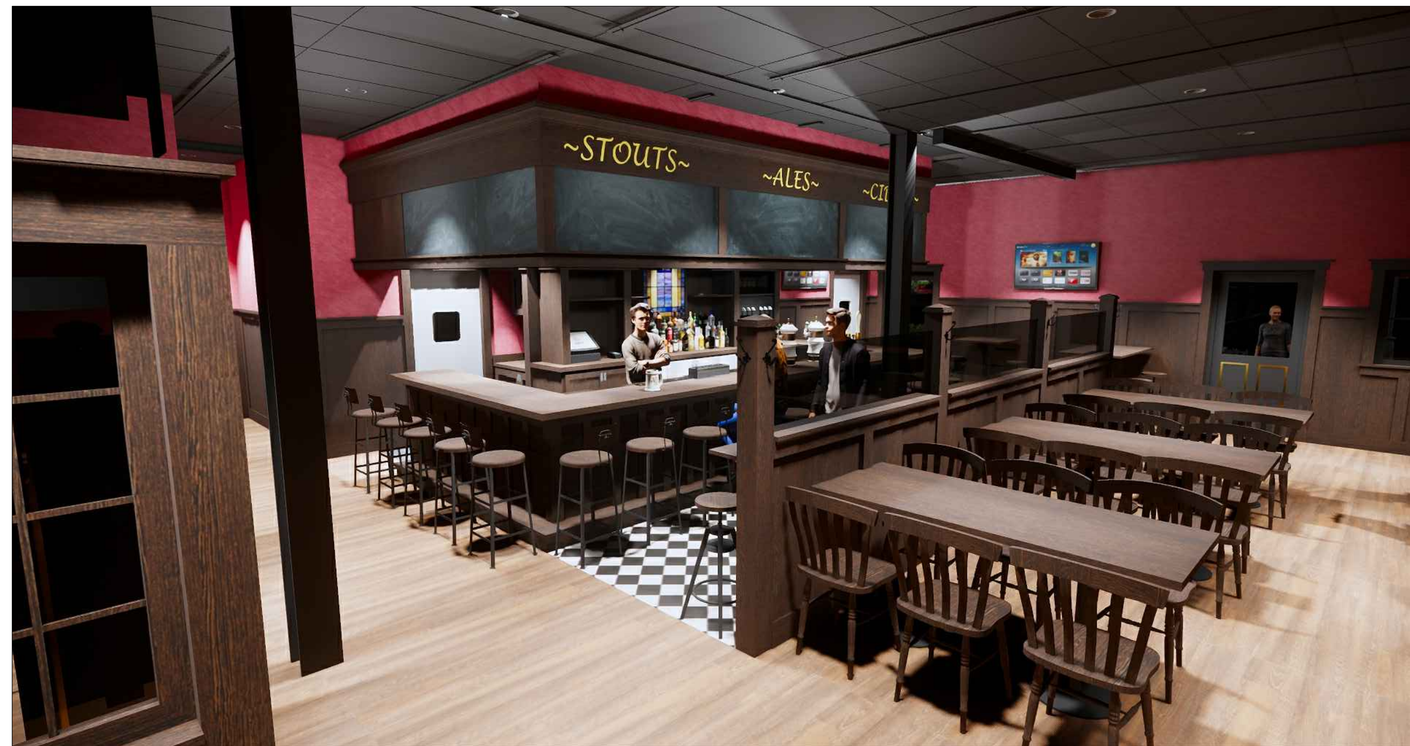
4/A3 INTERIOR 2