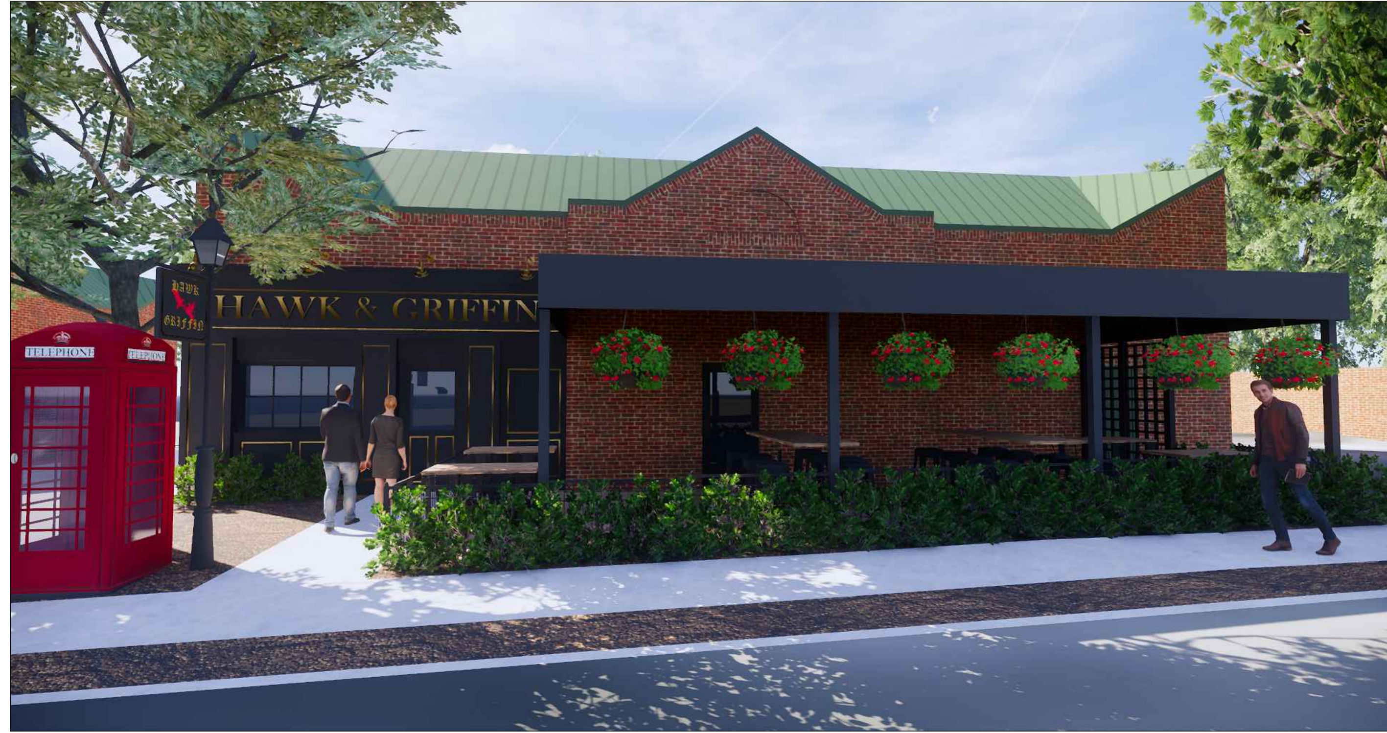
1/A3 LEWIS STREET ENTRANCE