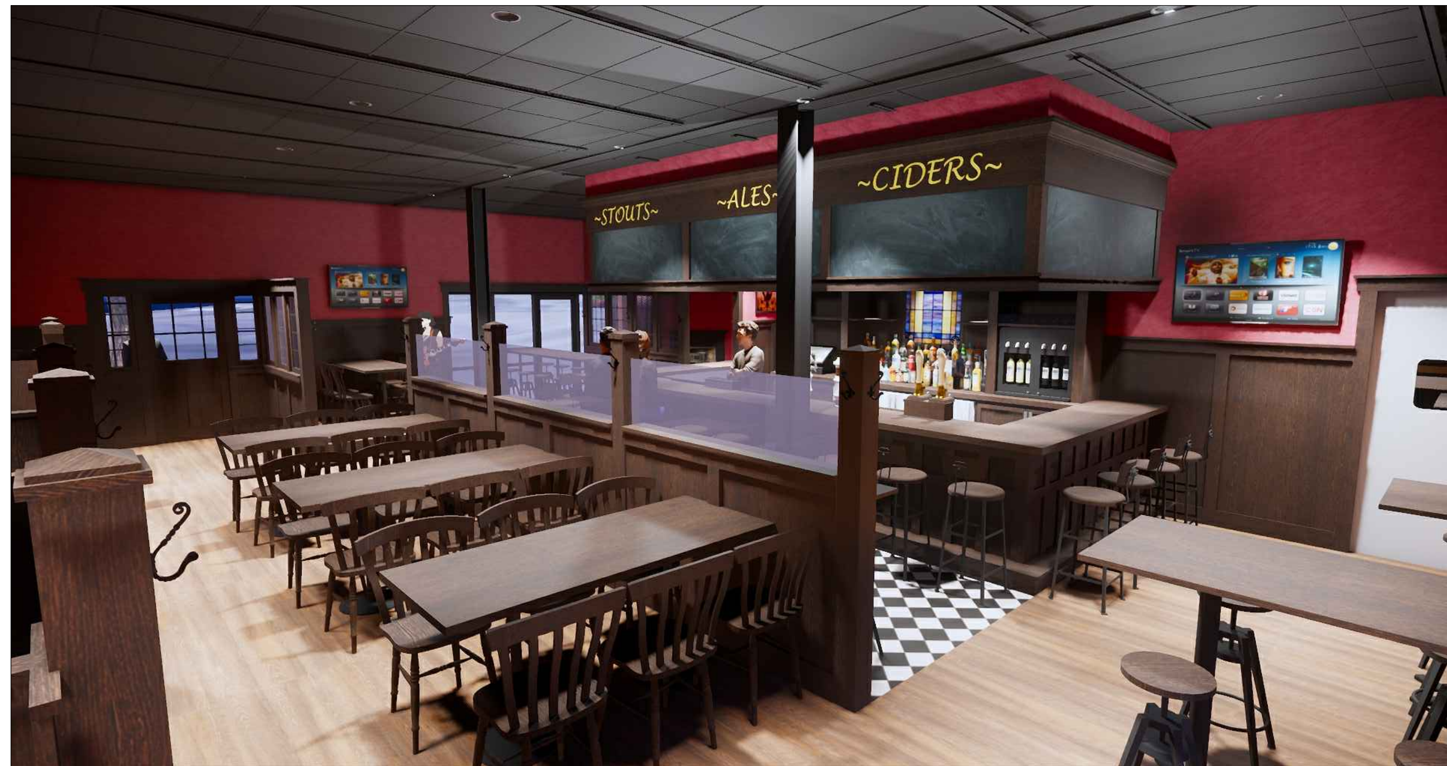
3/A3 INTERIOR 1