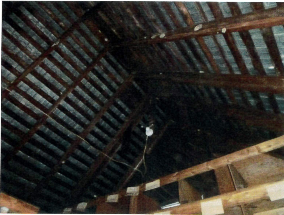
Photo #6 – Typical existing roof construction – rafters only, all web members removed