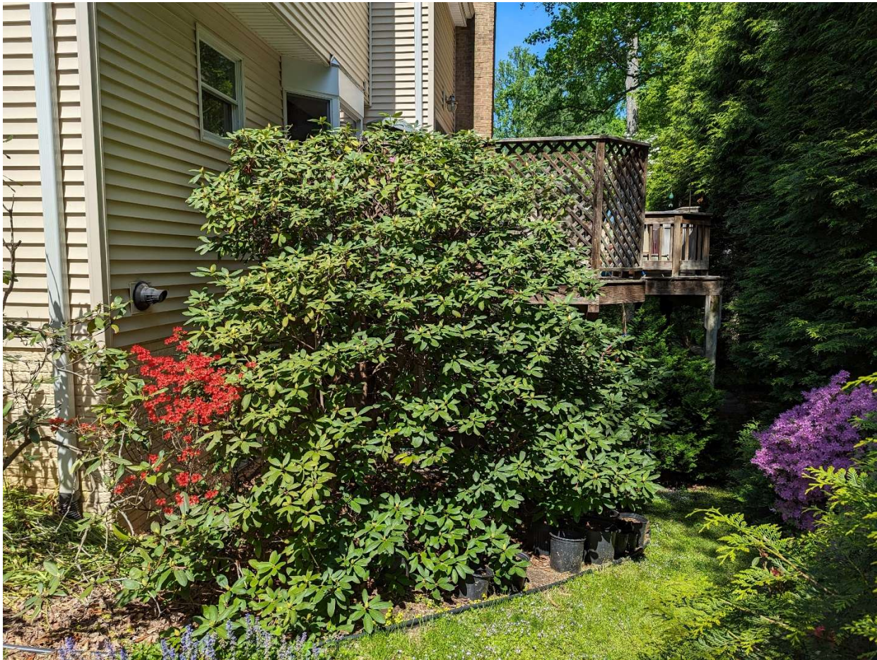
#1 - View Toward Right Side of Existing Deck