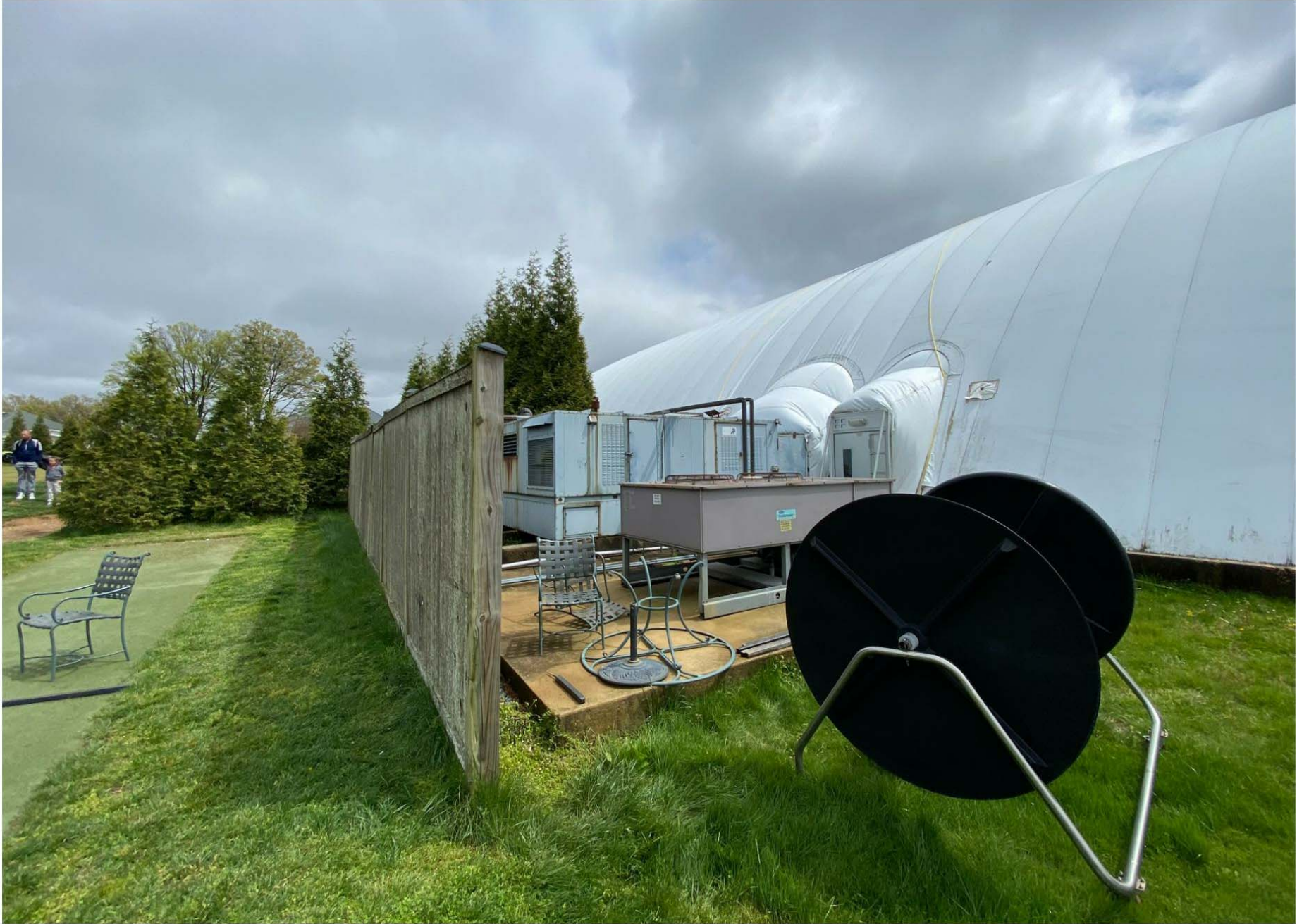
7 EXISTING UTILITIES AND BUBBLE TO BE IMPROVED/REPLACED (VIEW FACING SOUTH FROM DRIVING RANGE)