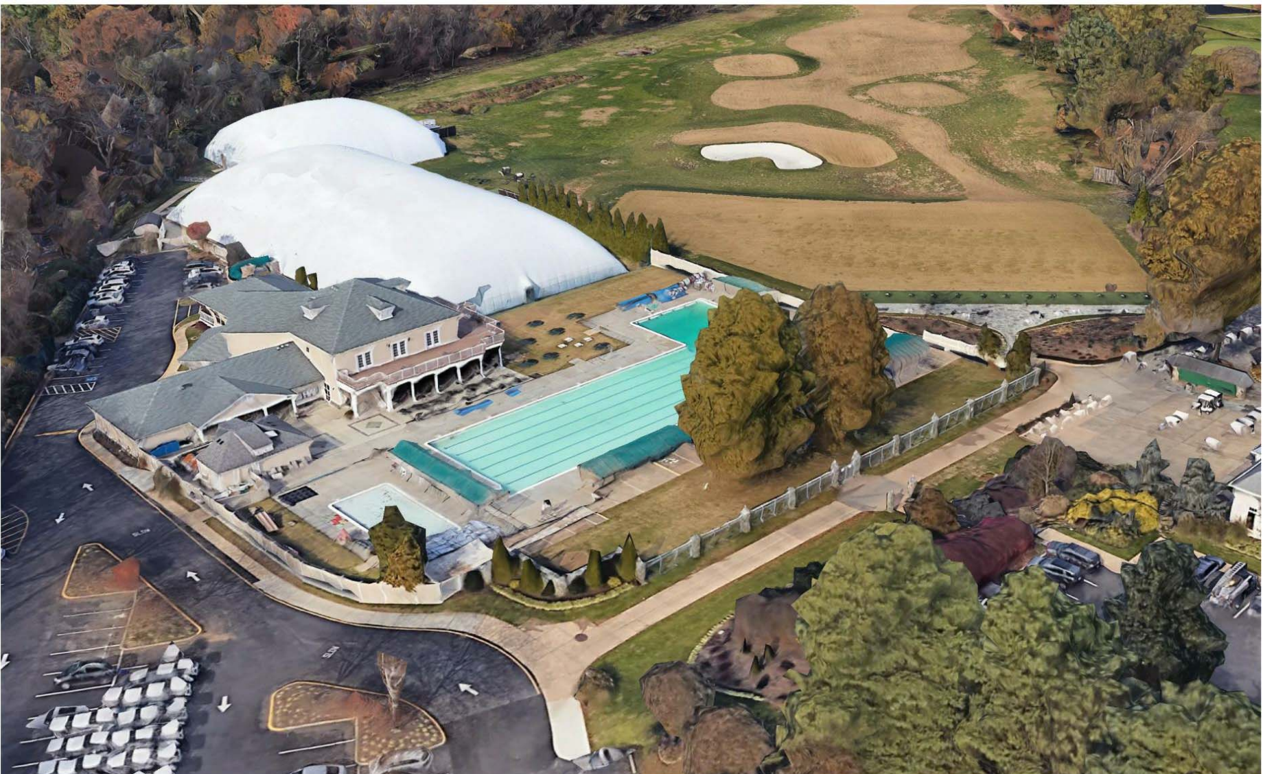
1 EXISTING PERSPECTIVE (FACING NORTHEAST)

WESTWOOD COUNTRY CLUB 800 MAPLE AVE EAST VIENNA, VA 22180