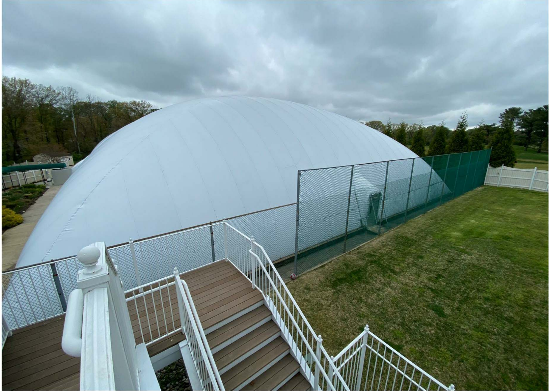
9 EXISTING TENNIS BUBBLE TO BE REPLACED (FACING EAST FROM ADJACENT EXISTING POOL HOUSE)