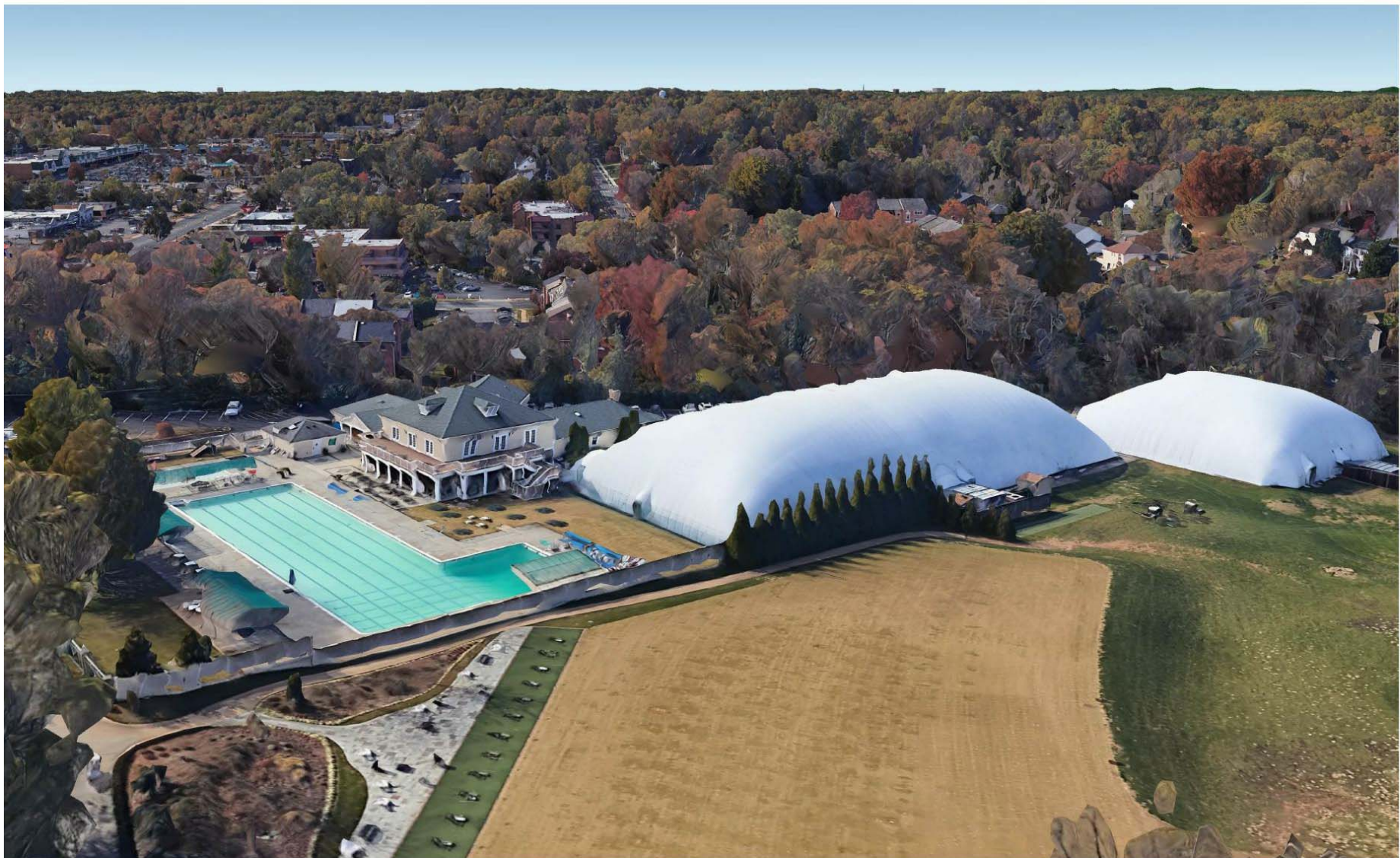
3 EXISTING PERSPECTIVE (FACING SOUTHEAST)