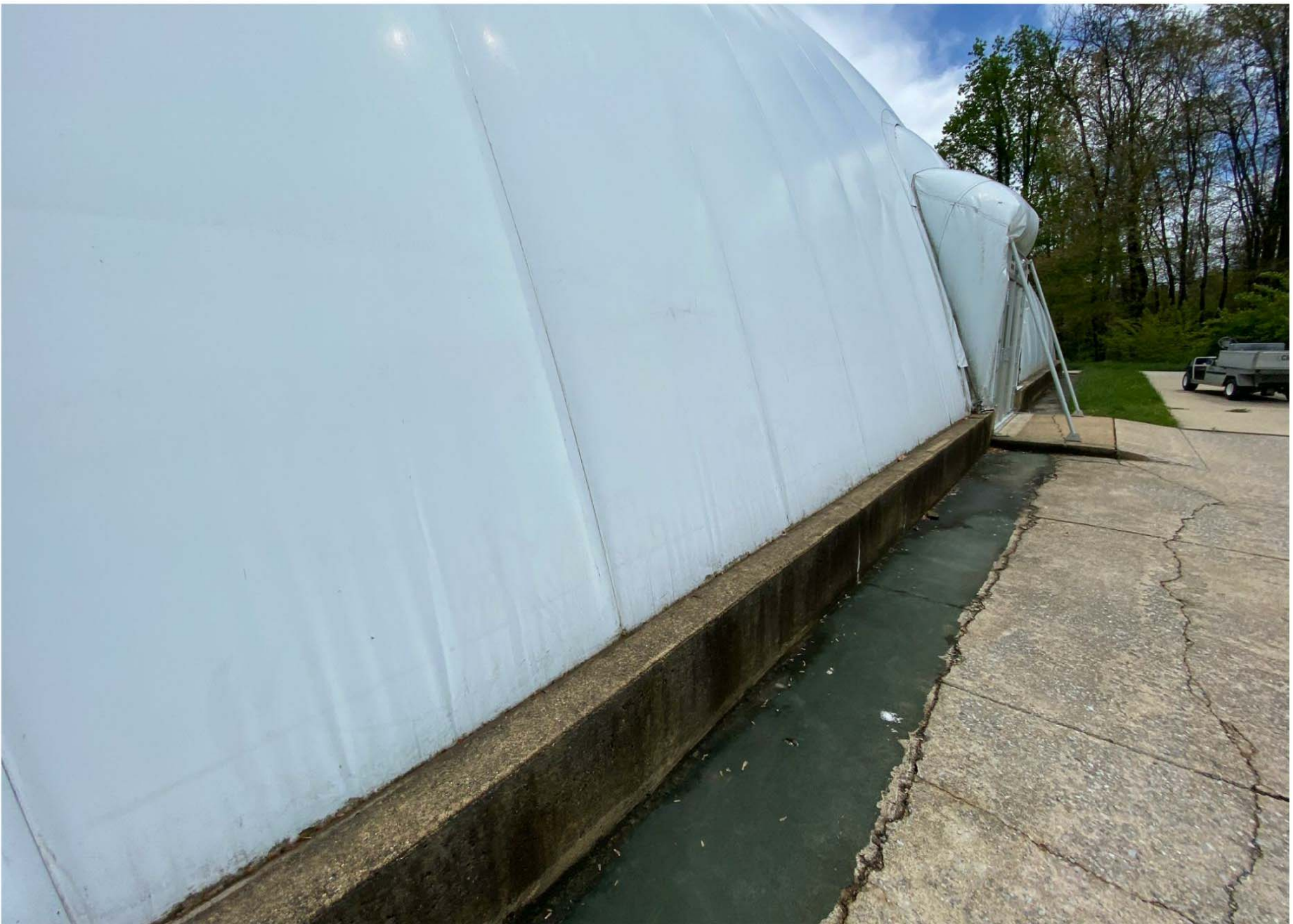
4 EXISTING TENNIS BUBBLE TO BE IMPROVED (VIEW OF EAST SIDE)