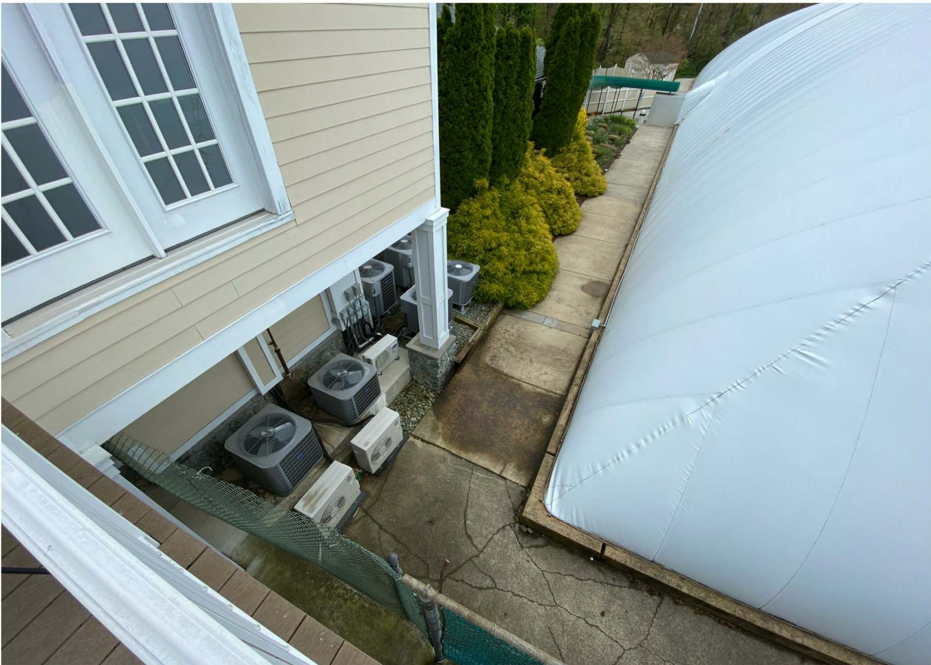
5 SOUTHEAST CORNER OF EXISTING TENNIS BUBBLE TO BE REPLACED AND PROPOSED WALKWAY (VIEW FACING EAST)