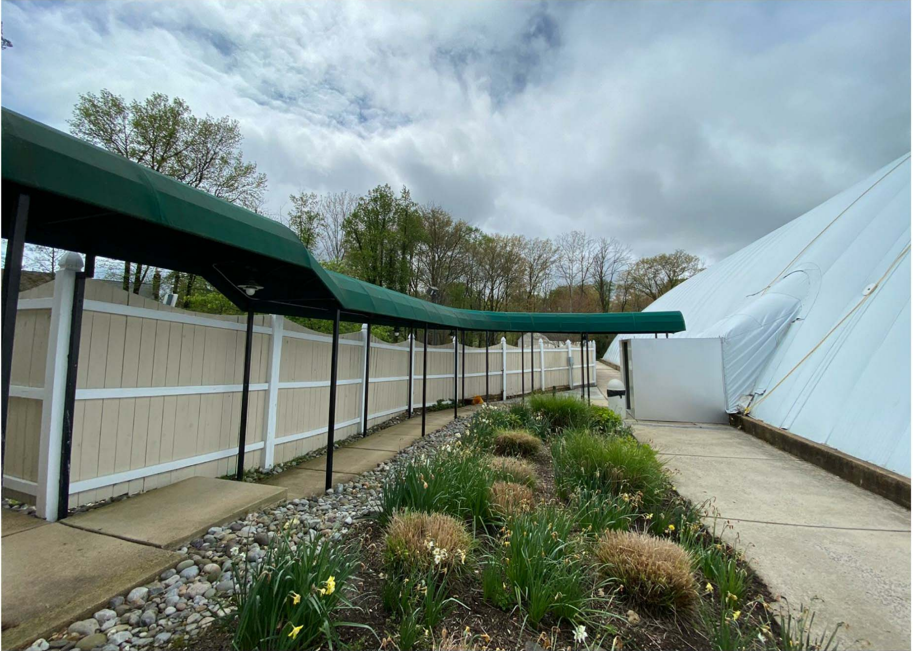
8 EXISTING TENNIS BUBBLE ENTRY ON SOUTH SIDE. FENCE AND WALKWAY TO BE REMOVED. (VIEW FACING EAST)