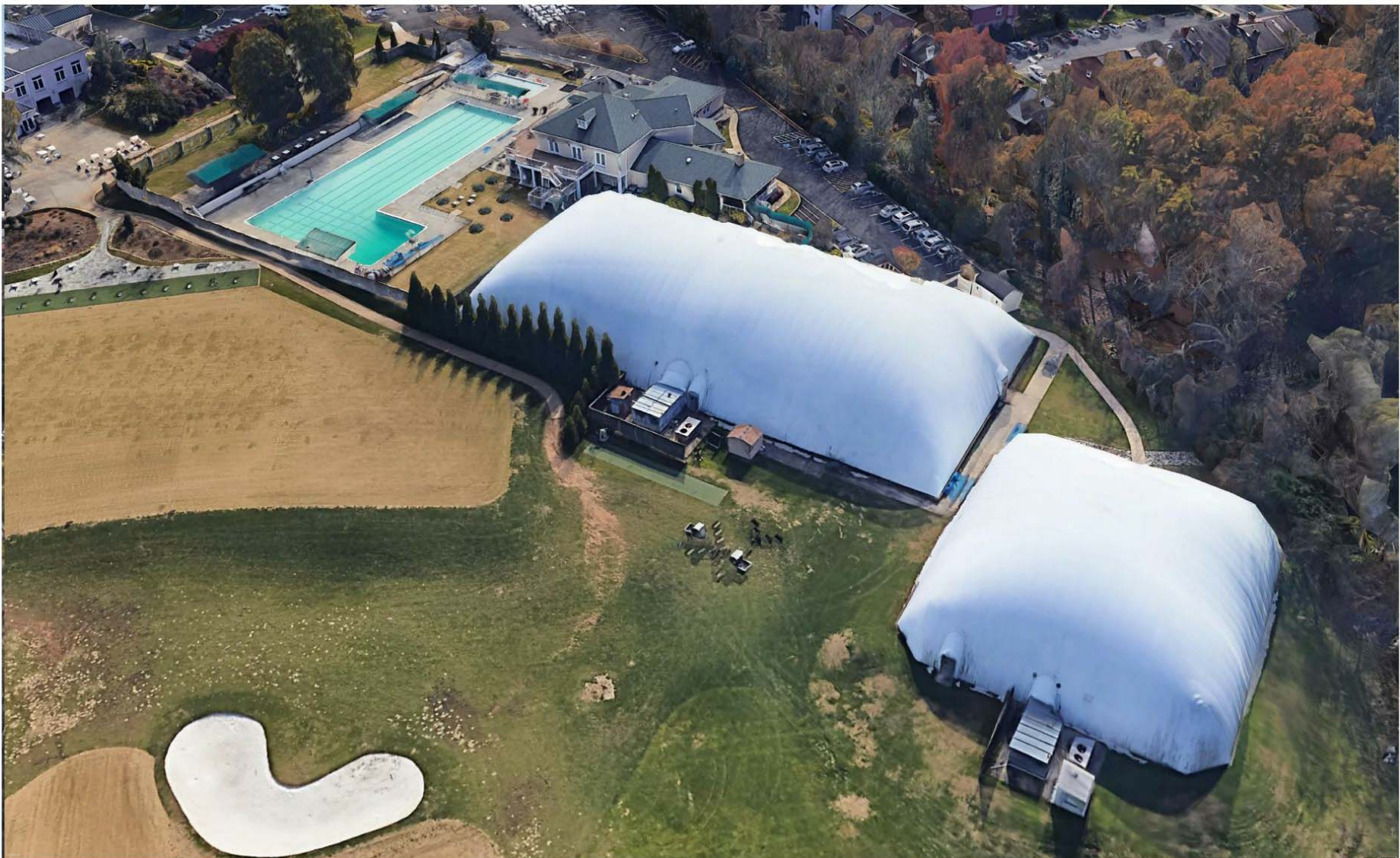
2 EXISTING PERSPECTIVE (FACING SOUTH)