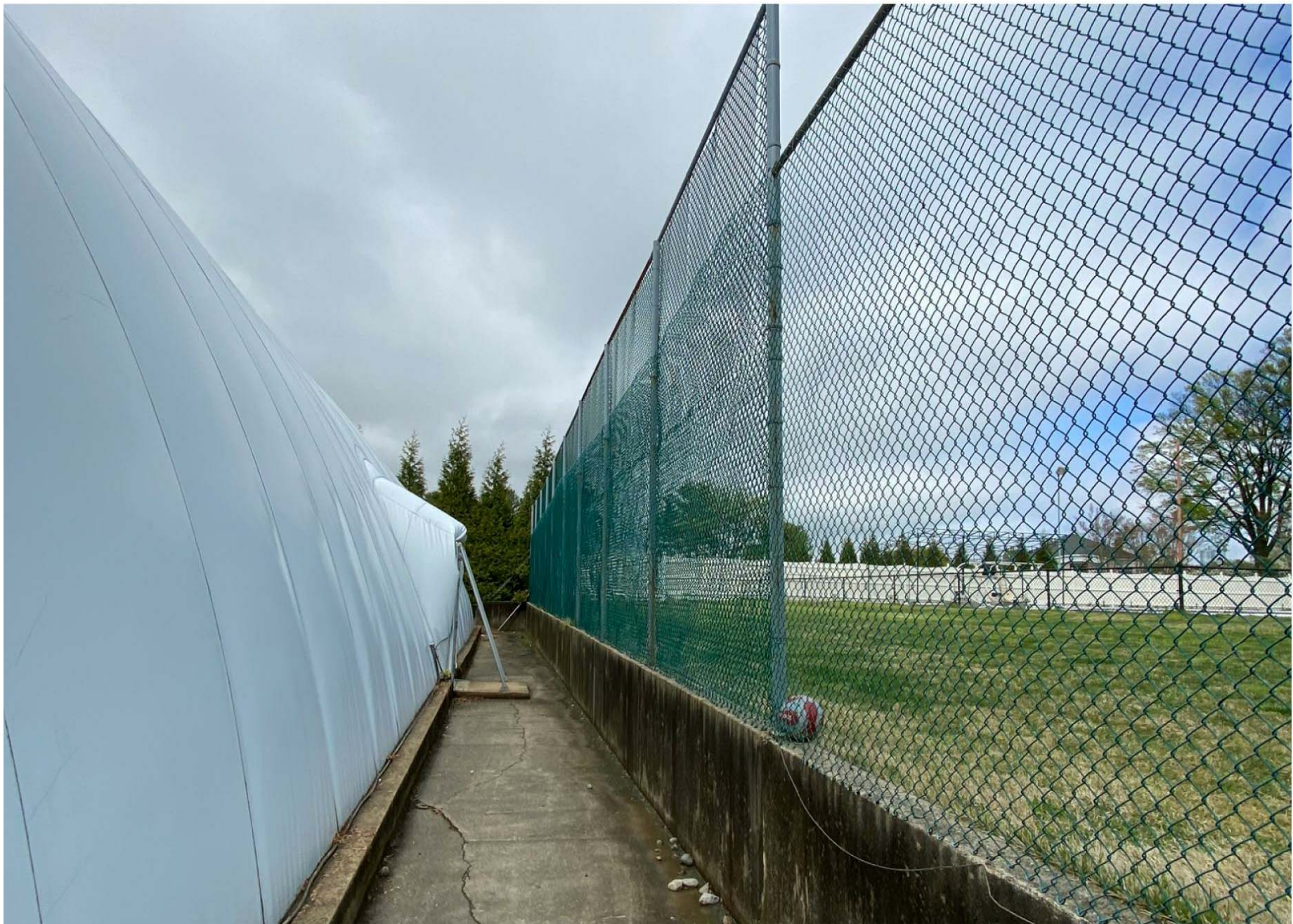
6 EXISTING TENNIS BUBBLE TO BE REPLACED (VIEW OF WEST SIDE AND CONNECTION TO POOL AREA)