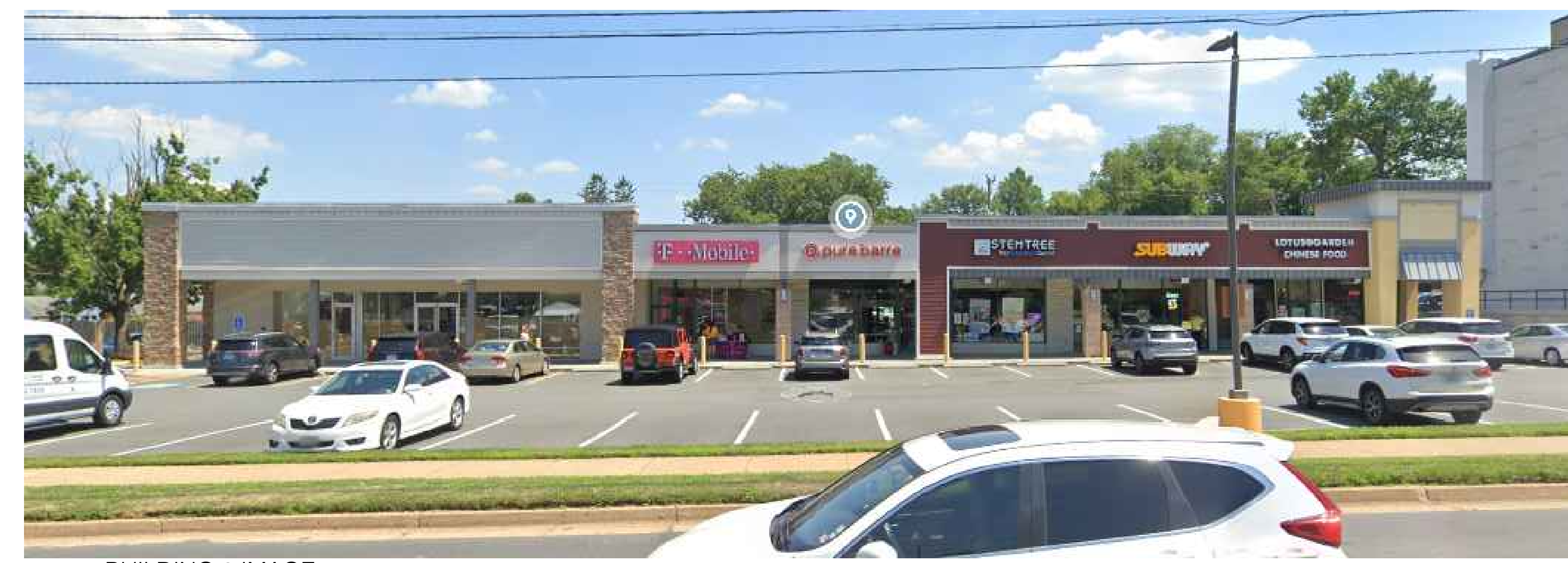
05 BUILDING 3 IMAGE N.T.S.