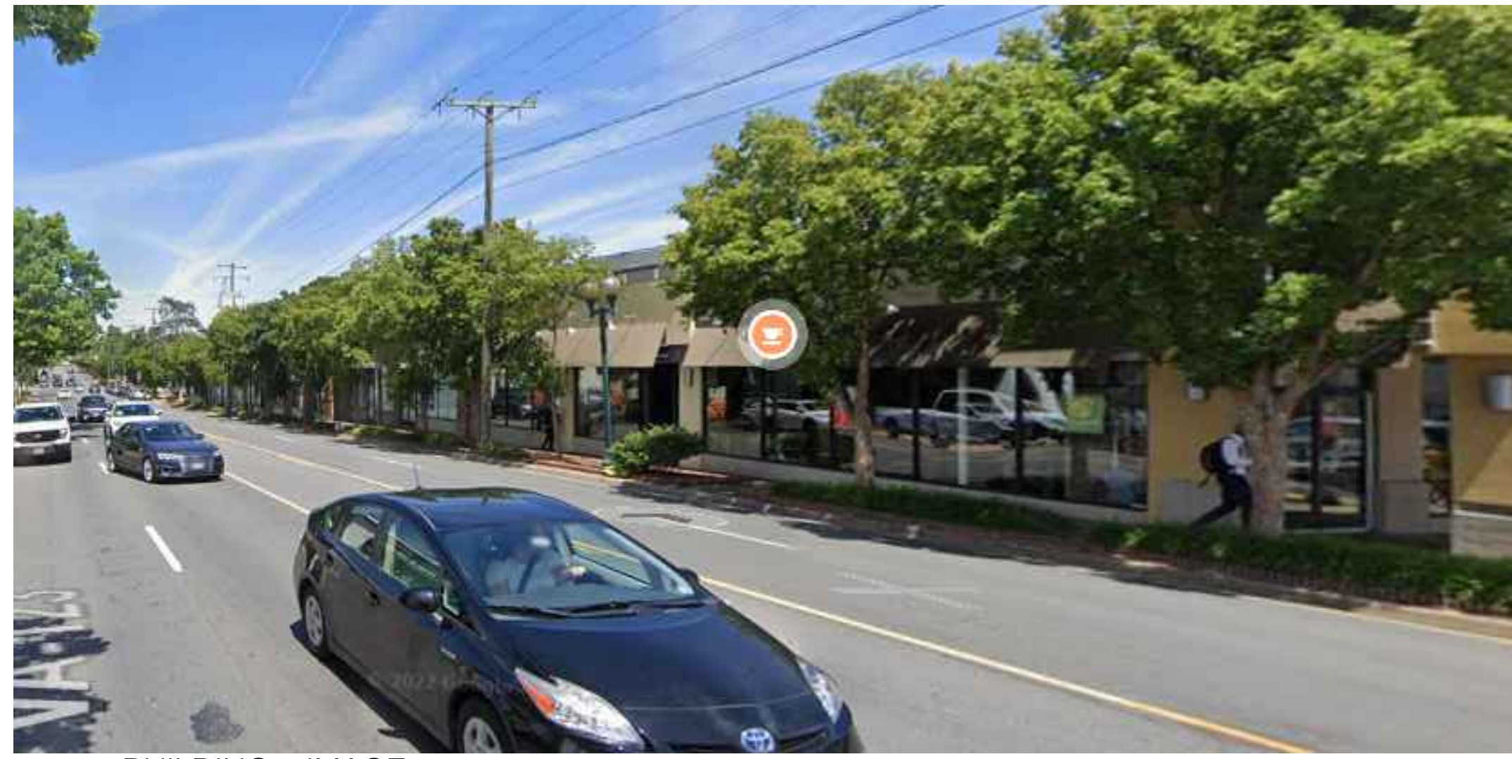
02 BUILDING 1 IMAGE N.T.S.