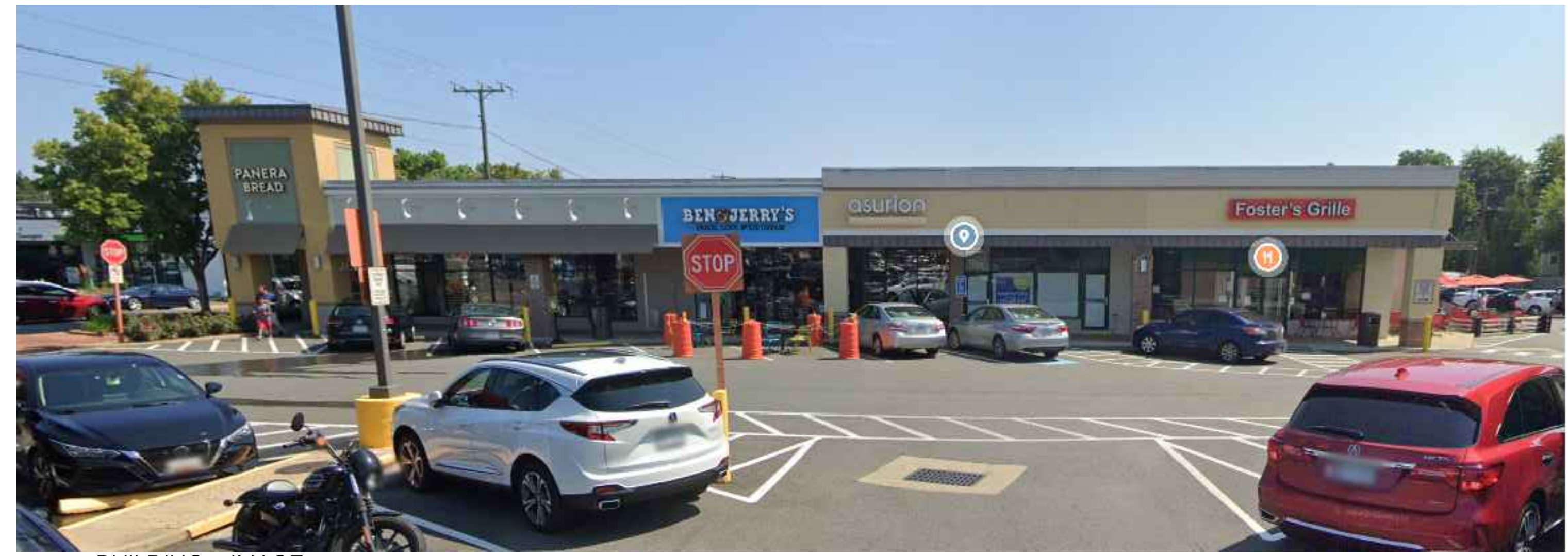
03 BUILDING 1 IMAGE N.T.S.