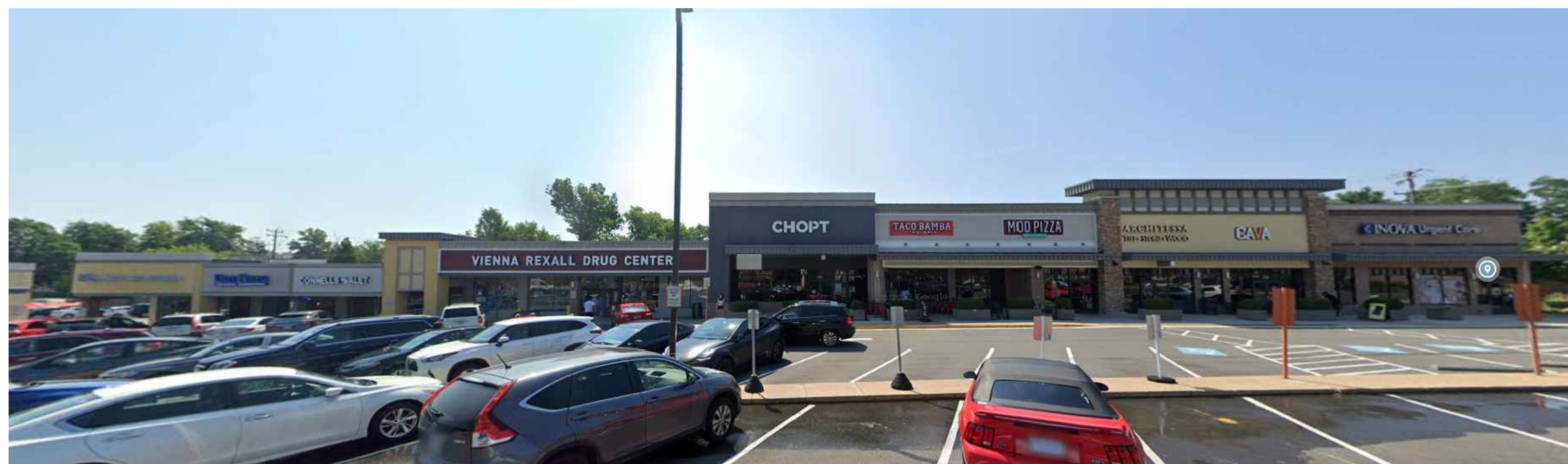
04 BUILDING 2 IMAGE N.T.S.