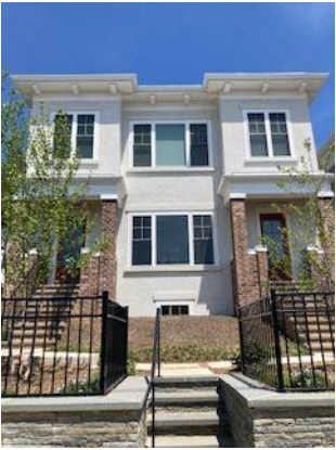
Building 2 131 Park St NE