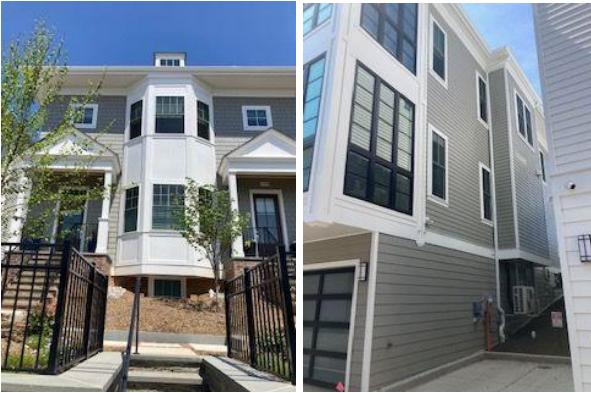
Building 3 129 Park St NE No Changes