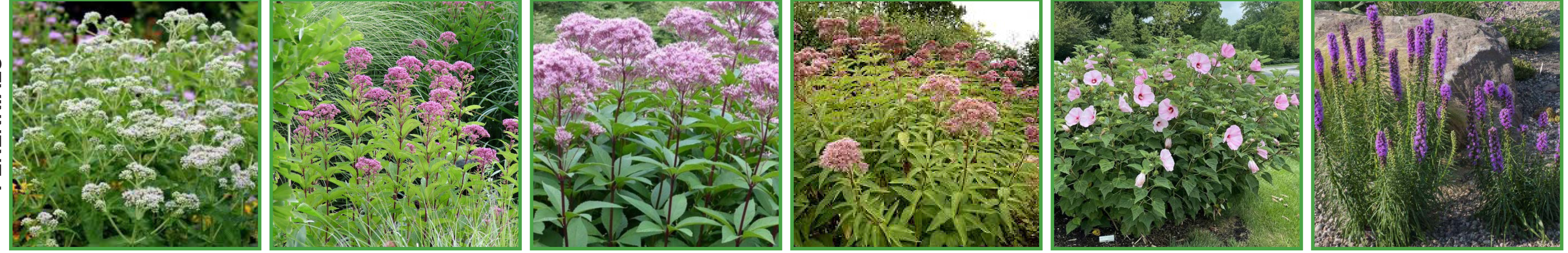
Common Boneset Eupatorium perfoliatum 3-5' perennial Coastal Joe-Pye Weed Eutrochium dubium 3-5' perennial Joe-Pye Weed Eutrochium fistulosum 5-7' perennial Spotted Joe Pye Weed Eutrochium maculatum 5-7' perennial Marsh Hibiscus Hibiscus moscheutos 3-7' perennial Blazing Star Liatris spicata 2-4' perennial