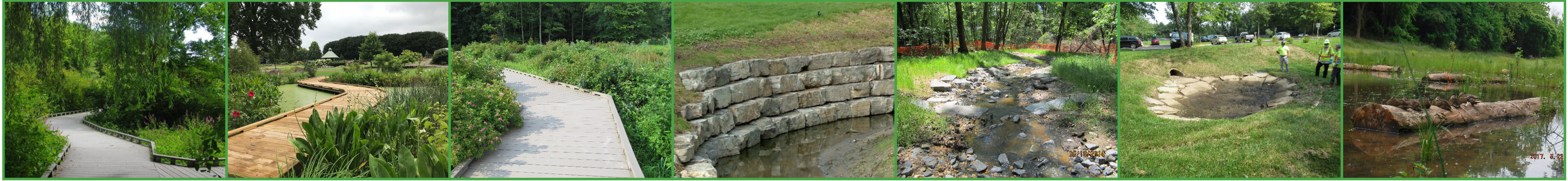
Boardwalk case study: Wickham Park The Wetlands Garden