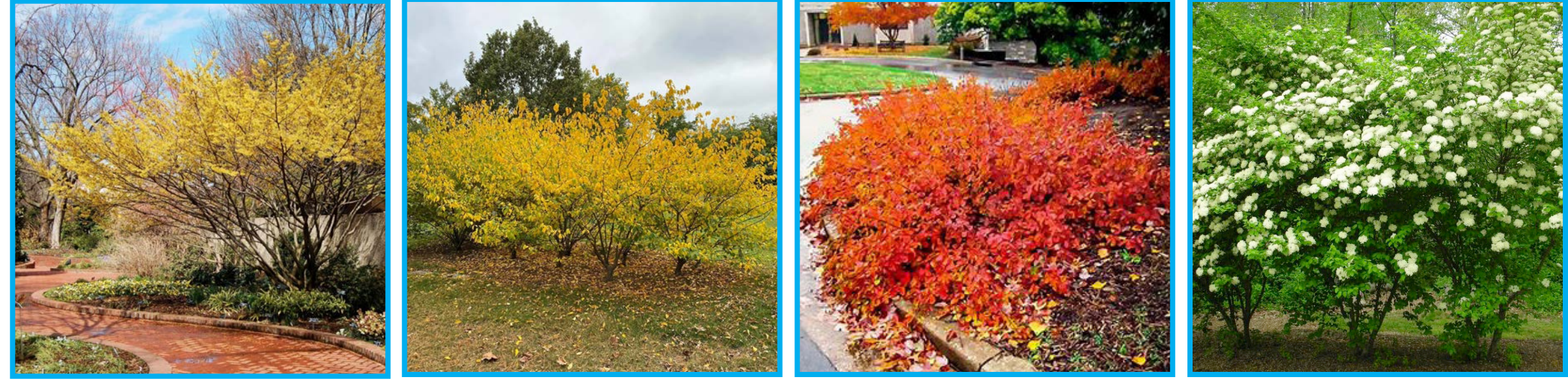
American Witchhazel Hamamelis virginiana 15-20' shrub Spicebush Lindera benzoin 6-12' shrub Gro-Low Sumac Rhus aromatica 'Gro-Low' 2-4' shrub Blackhaw Viburnum prunifolium 12-15' shrub