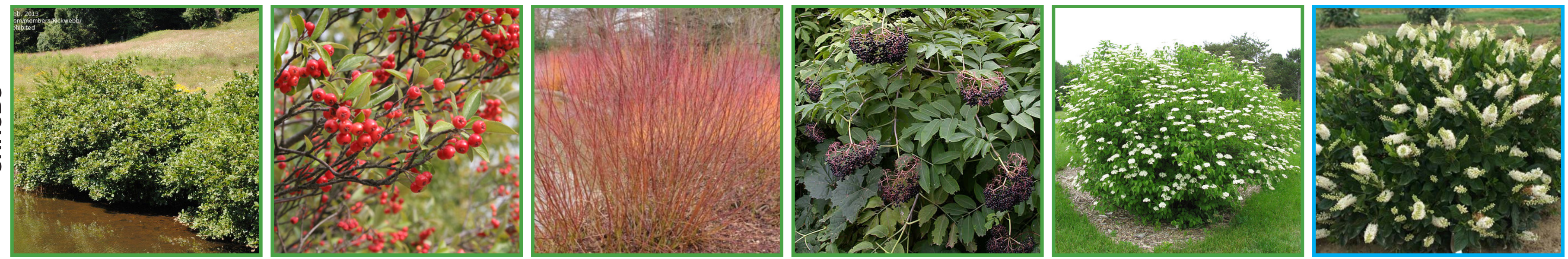
Smooth Alder Alnus serrulata 10-20' shrub Red Chokeberry Aronia arbutifolia 6-12' shrub Silky Dogwood Cornus amomum 6-12' shrub Elderberry Sambucus canadensis 6-12' shrub Arrowwood Viburnum dentatum 6-12' shrub Sweet Pepperbush Clethra alnifolia 3-6' shrub