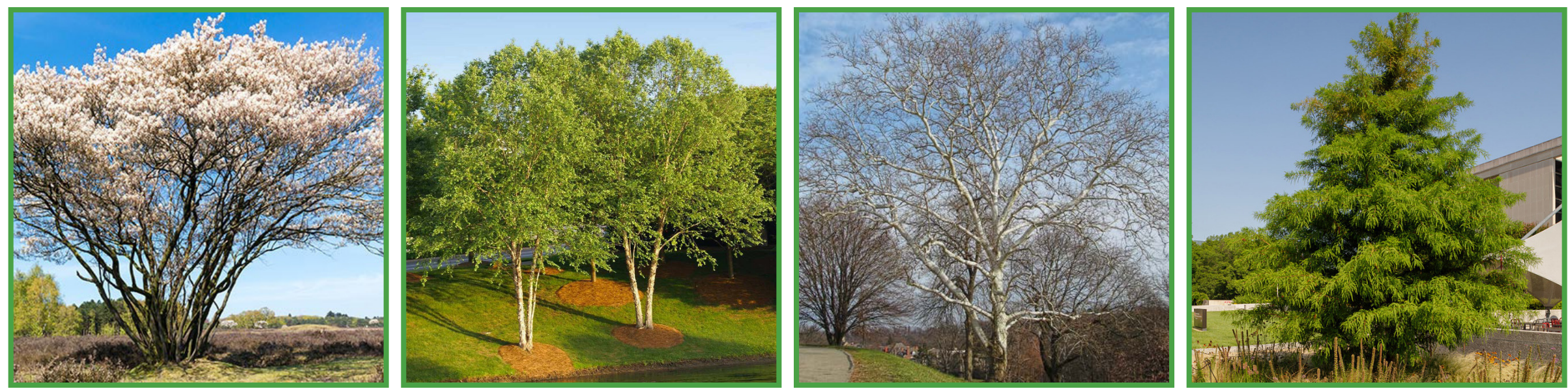
Canadian Serviceberry Amelanchier canadensis 15-25' tree River Birch Betula nigra 40-70' tree Sycamore Platanus occidentalis 75-100' tree Bald Cypress Taxodium distichum 50-70' tree