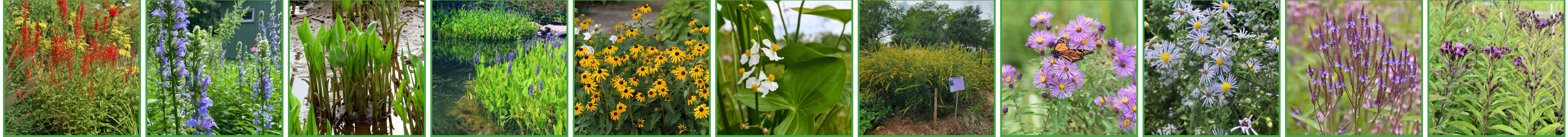
Cardinal Flower Lobelia cardinalis 2-4' perennial Blue Lobelia Lobelia siphilitica 2-4' perennial Arrow Arum Peltandra virginica 2-4' perennial Pickerelweed Pontederia cordata 2-4' perennial Black-eyed Susan Rudbeckia fulgida 2-4' perennial Broadleaf Arrowhead Sagittaria latifolia 2-4' perennial Rough Goldenrod Solidago rugosa 3-5' perennial New England Aster Symphyotrichum novae-angliae 3-6' perennial Purple-Stemmed Aster Symphyotrichum puniceum 2-7' perennial Blue Vervain Verbena hastata 2-6' perennial New York Ironweed Vernonia noveboracensis 5-7' perennial