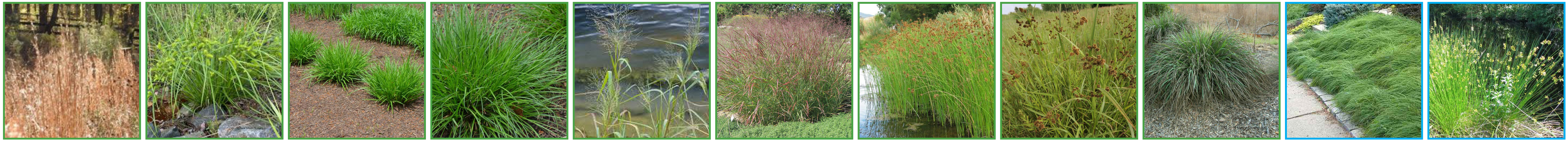
Broomsedge Andropogon virginicus 2-4' grass/sedge Bristly Sedge Carex comosa 2-4' grass/sedge Shallow Sedge Carex lurida 1-3' grass/sedge Fox Sedge Carex vulpinoidea 1-3' grass/sedge Fall Panic Grass Panicum dichotomiflorum 1-6' grass/sedge Switchgrass Panicum virgatum 2-5' grass/sedge Softstem Bulrush Schoenoplectus tabernaemontani 4-8' grass/sedge Green Bulrush Scirpus atrovirens 3-5' grass/sedge Eastern Gamagrass Tripsacum dactyloides 3-6' grass/sedge Pennsylvania Sedge Carex pensylvanica 1-2' grass/sedge Soft Rush Juncus effusus 2-4' grass/sedge