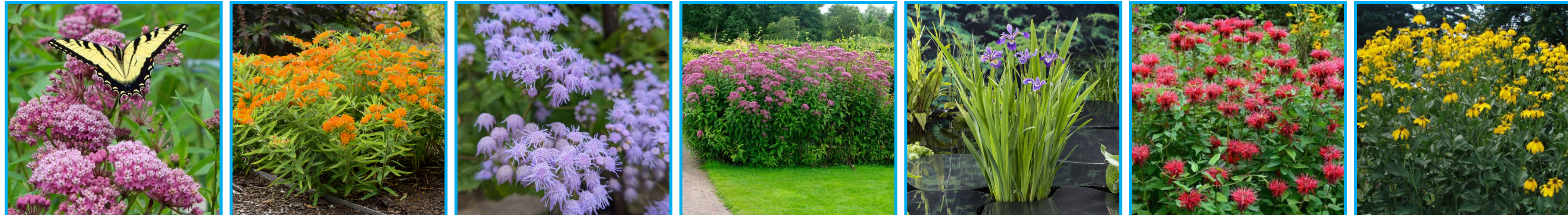
Swamp Milkweed Asclepias incarnata 3-5' perennial Butterfly Weed Asclepias tuberosa 1-2' perennial Blue Mistflower Conoclinium coelestinum 1-2' perennial Sweet Joe-Pye Weed Eupatorium purpureum 4-7' perennial Blue Flag Iris versicolor 2-3' perennial Bee Balm Monarda didyma 2-4' perennial Cutleaf Coneflower Rudbeckia laciniata 3-4' perennial