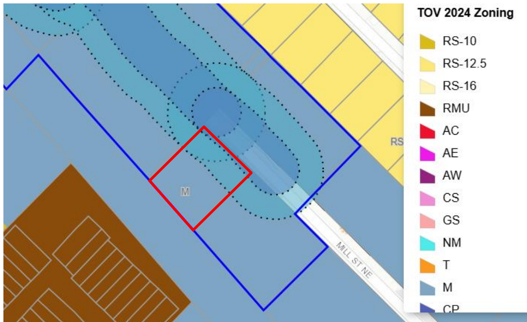
Figure 2: Town of Vienna Zoning Map. The subject property is indicated by the red outline.

Per the Town's Zoning Map (Figure 2), the property is located in the Mill District zone. The purpose of the Mill District is to provide standards for light industrial uses along the W&OD Railroad corridor, which allows private indoor recreational uses by conditional use per Section 18-304 of the Town Code. The entirety of the property is within the Town's Resource Management Area; the half of the property closest to Mill Street NE is within the 100' Resource Protection Area (RPA) while the portion immediately abutting Mill Street is within the 50' RPA.