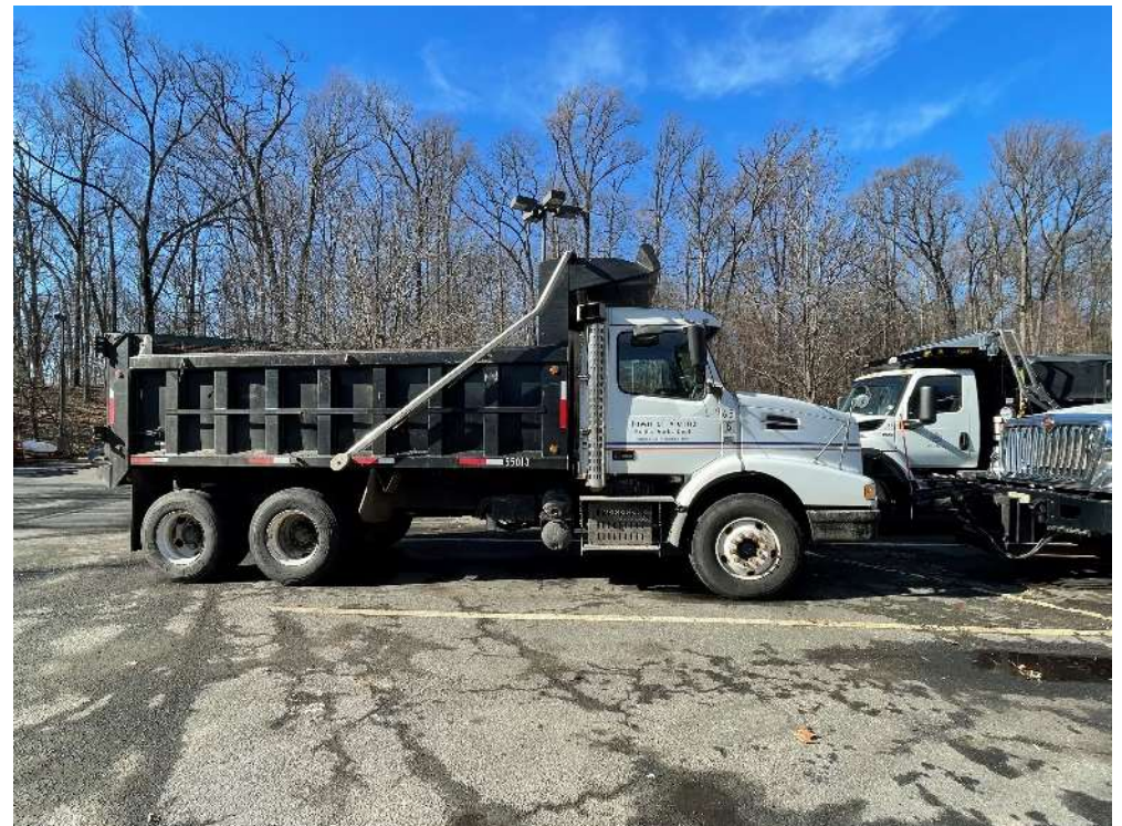
Disposal occurs using tandem dump truck