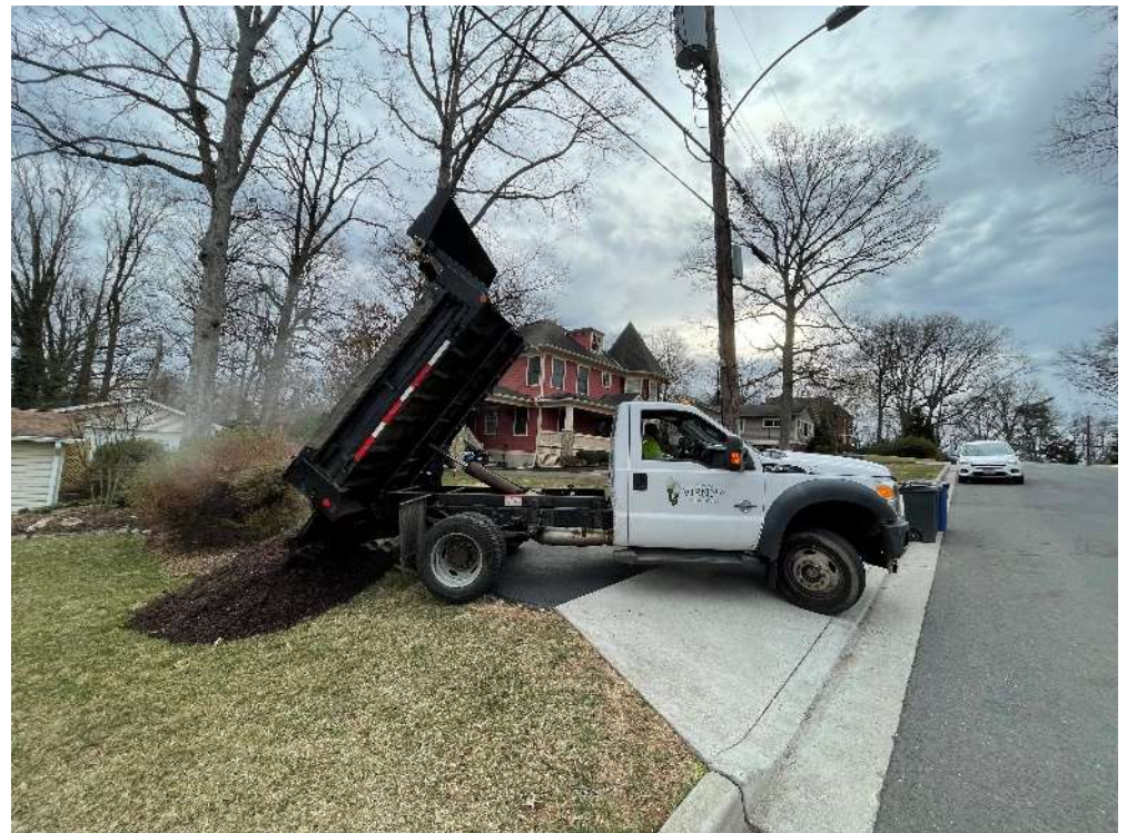
Deliveries occur using 1-ton dump truck

* Multiple loads requested with each order