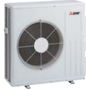
Outdoor Unit: MUZ-GL18NA-U1