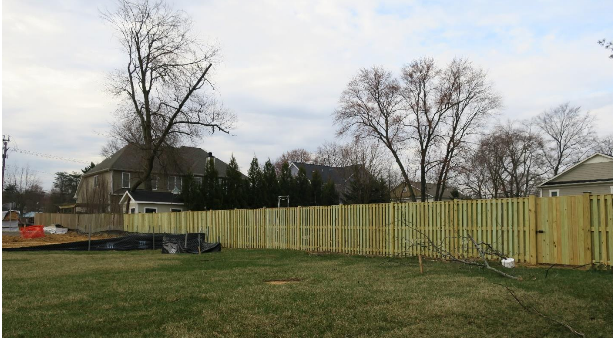
Figure 1 - Fences along the shared property line of subject site and affected single-family detached residential properties