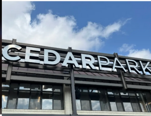
Cedar Park Shopping Center hosts the new Ace Hardware store in Vienna.

VIENNA, VA — Vienna's new Ace Hardware celebrated its opening with a ribbon cutting with town officials Thursday.