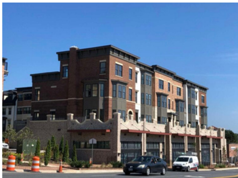
245 Maple Ave W Vienna Market