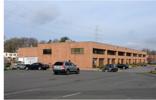
204 Mill St 7,978 sqft