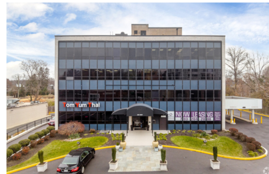
226 Maple Ave W 5,890 sqft