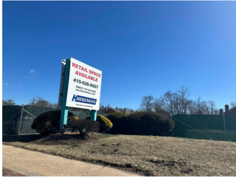
444 Maple Ave W