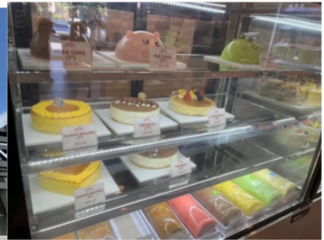
Shilla Bakery's grand opening celebration in Vienna is planned on Wednesday, July 30.

VIENNA, VA — After Korean-style Shilla Bakery opened its doors in Vienna during June, a grand opening celebration is planned Wednesday.