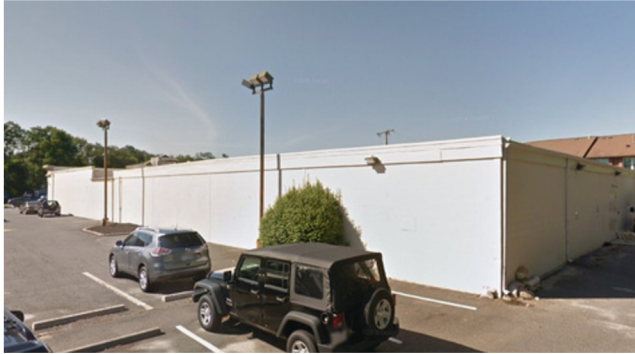
419-427 Maple Ave E 8,777 sqft