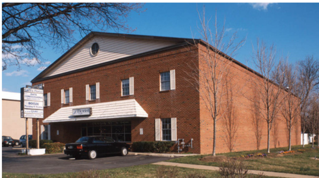
512 Maple Ave W 6,985 sqft