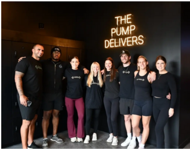
PUMP24 celebrated its grand opening with Town of Vienna officials at a ribbon cutting on Oct. 30.

VIENNA, VA — PUMP24, a new 24-hour gym, celebrated its grand opening on Maple Avenue with Town of Vienna officials on Oct. 30.