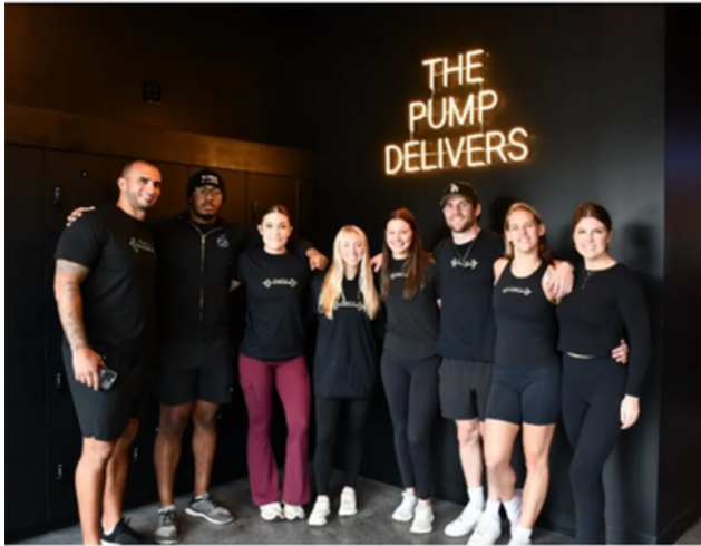
PUMP24 celebrated its grand opening with Town of Vienna officials at a ribbon cutting on Oct. 30.

VIENNA, VA — PUMP24, a new 24-hour gym, celebrated its grand opening on Maple Avenue with Town of Vienna officials on Oct. 30.