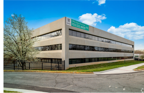
901 Follin Lane