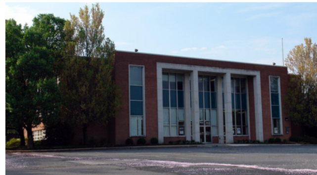
515 Maple Ave E