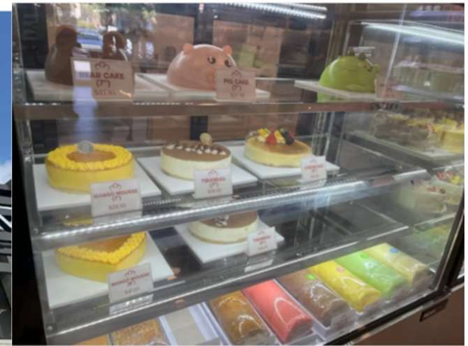
Shilla Bakery's grand opening celebration in Vienna is planned on Wednesday, July 30.

VIENNA, VA — After Korean-style Shilla Bakery opened its doors in Vienna during June, a grand opening celebration is planned Wednesday.