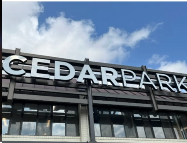
Cedar Park Shopping Center hosts the new Ace Hardware store in Vienna.

VIENNA, VA — Vienna's new Ace Hardware celebrated its opening with a ribbon cutting with town officials Thursday.