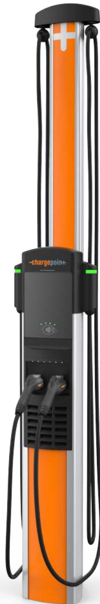
Dual port, pedestal mount, 23 ft cable