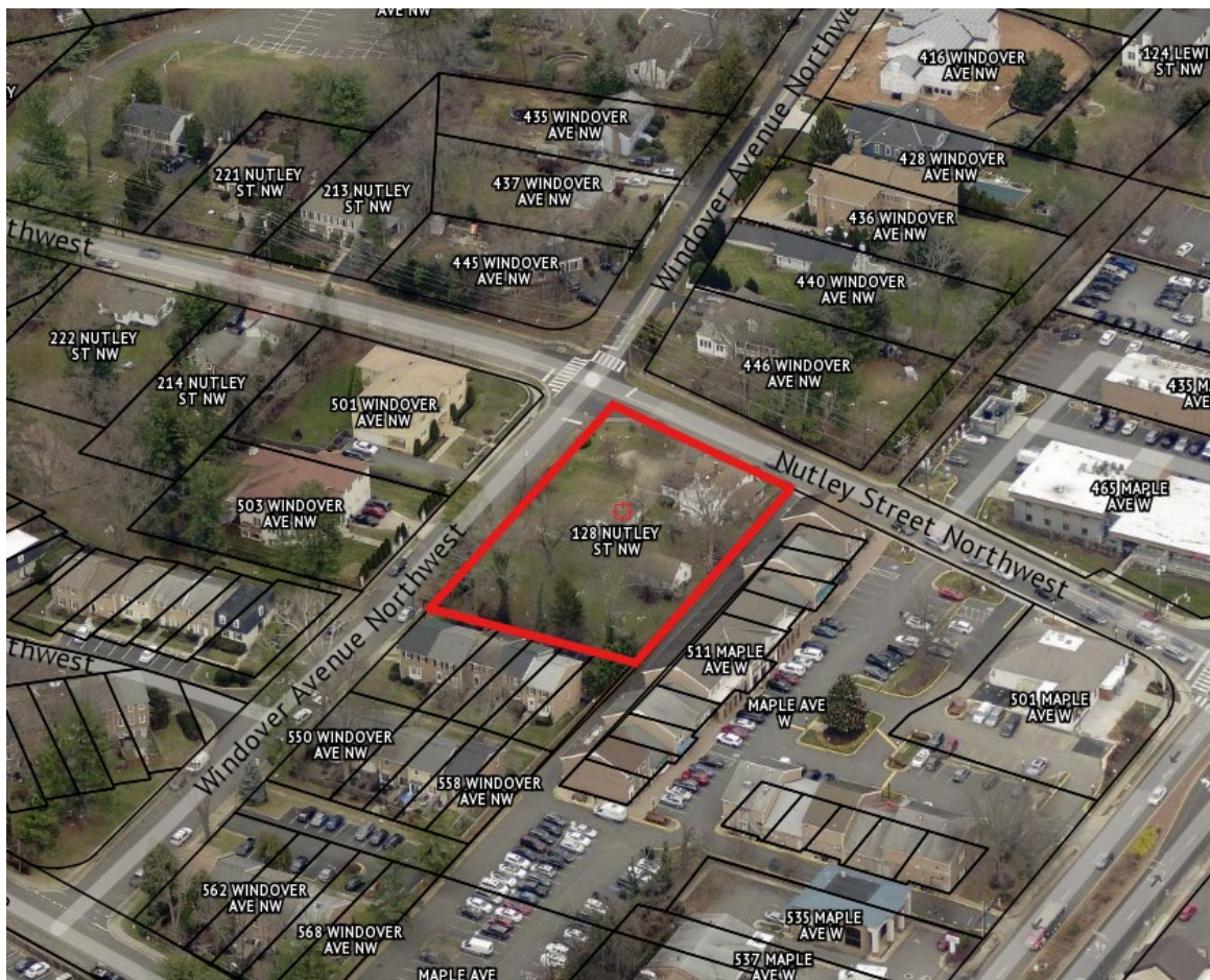
Figure 1 – Aerial image of site dated December 2023

The subject site, 128 Nutley Street NW, includes a 2,624-square-foot two-story house, a 572-square-foot detached garage, and a 500-square-foot shed on a 29,553-square-foot lot. The house was built in approximately 1900 with an addition constructed in 1976. The site is currently zoned Residential – Single-Unit, 12,500 sq. ft. (RS-12.5), which only allows for single-unit detached residences as a principal use by right. The site abuts commercial uses within the Village Green shopping center to its east and townhouses to its south, both of which are on the same block. The properties across both Nutley Street NW to the north and Windover Avenue NW to the west are single-family detached residences.