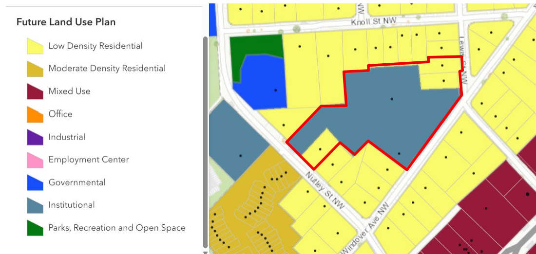
Figure 2 – Town of Vienna Future Land Use Map with Green Hedges School property outlined in red.

As illustrated on the Town's Comprehensive Plan Future Land Use Map (p. 38 of the Comprehensive Plan), the subject property is designated Institutional and Low Density Residential (Figure 2). Institutional areas in the Comprehensive Plan include public and private schools and related educational facilities that support community needs. Green Hedges School has occupied this site (with some changes to the school grounds) for 70 years, and the Land Use designation reflects the school's continued role as an established institutional use within a predominantly residential context.