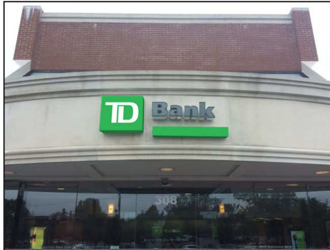
COMPOSITE PHOTOGRAPH with PROPOSED SIGNAGE