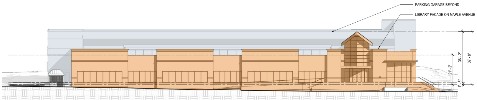
MAPLE AVENUE ELEVATION NOT TO SCALE