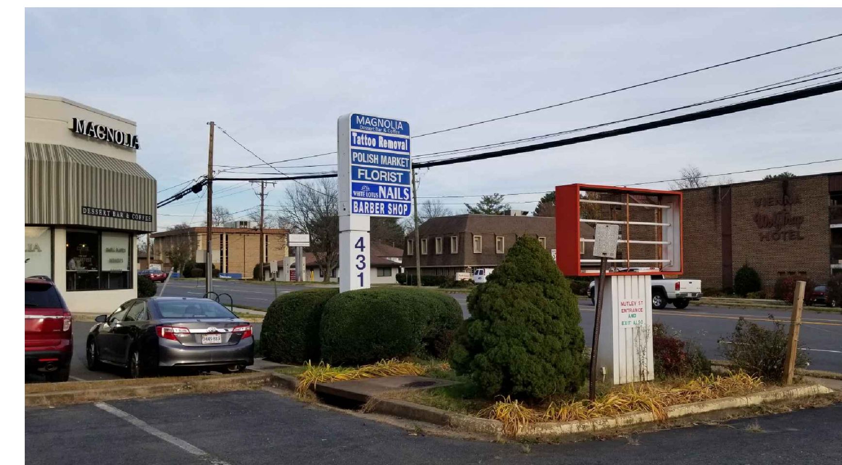
ENTRANCE SIGN LOCATION