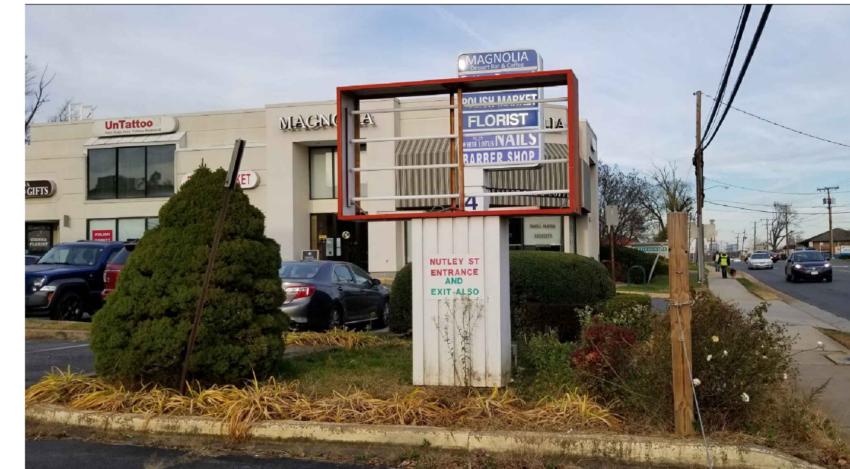
ENTRANCE SIGN LOCATION