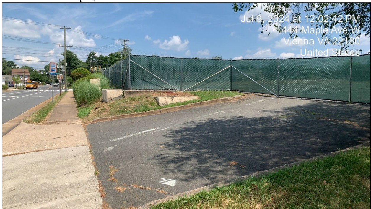
Nutley Street NW, looking towards Maple Avenue W