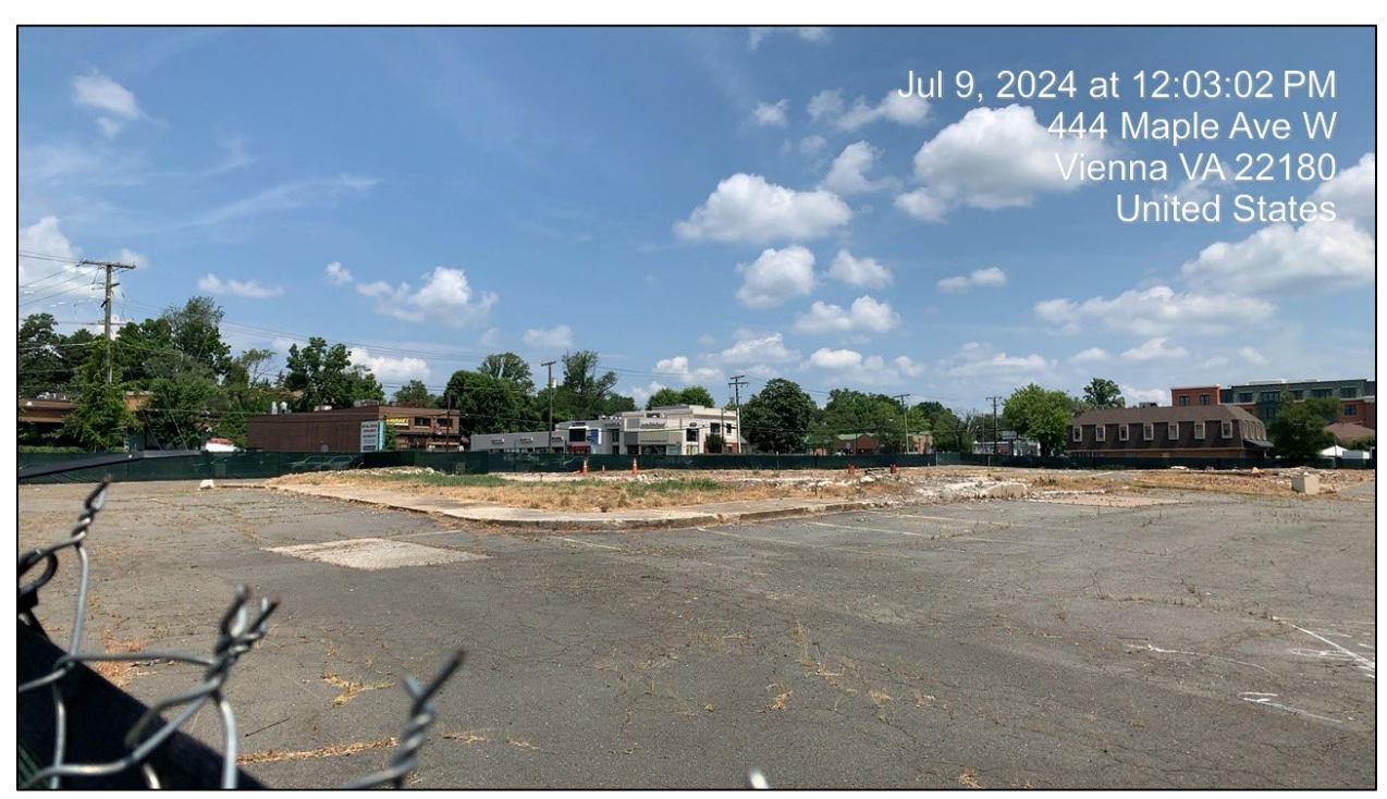
Site interior looking north-west, over fence