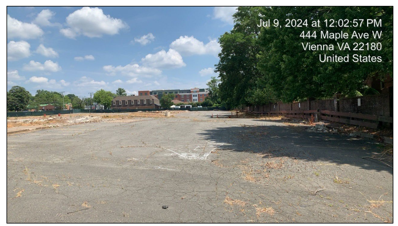
Site interior looking north-east, over fence