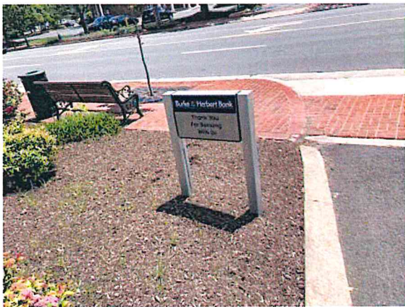
Existing (side A)