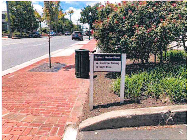
Existing (side A)