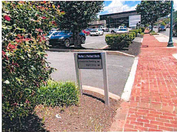
Existing (side B)