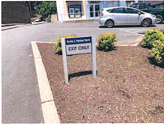
Existing (side B)