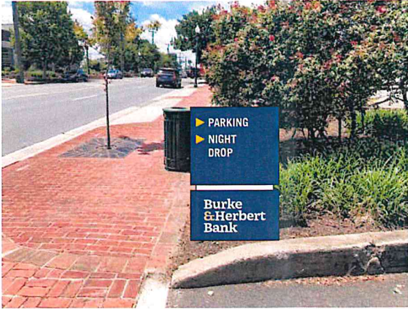
Proposed (side A)