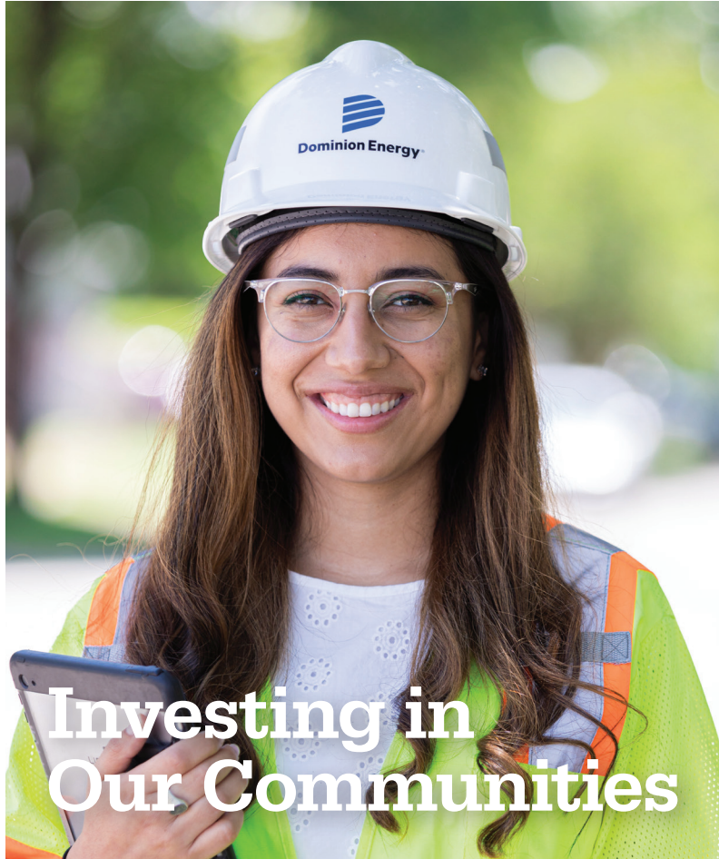
Dominion Energy image. Not project specific.