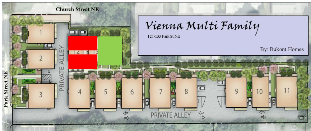
Figure 3 - Illustrative plan showing suggested change by Planning Commission to remove building 14 to provide more open space shown in green and possibly rotate buildings 12 & 13 shown in red.

During discussions with the Planning Commission, the question was asked about removing another building to make room for more open space. If Building 14 were removed from the proposed development, approximately 1,265 square feet of lot coverage could be converted to shared green space. This would change the requested rear setback from 15 feet to the 20 feet required for Building 11. While converting this building to open space would serve to provide more shared open area for the residents, it would only reduce the lot coverage by 2%, compared to the proposal. The applicant has revised the concept plan to match the suggestion by some Planning Commissioners.