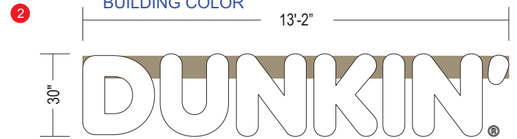
GRAPHIC DETAIL SCALE: 1/4" = 1'-0"