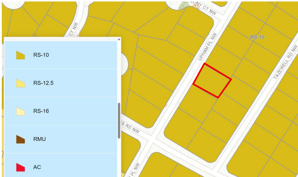
Figure 2: Town of Vienna Zoning Map. The subject property is indicated by the red bold boundary.