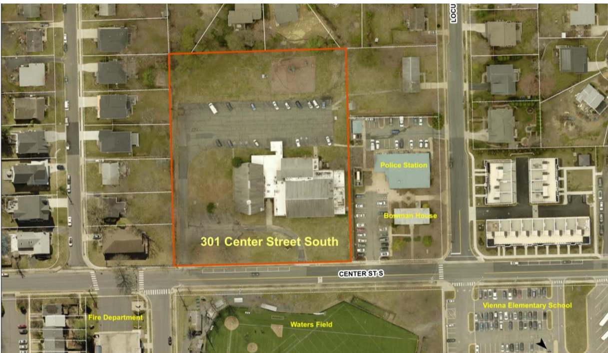
Figure 1 – 301 Center Street South Context Map

The property located at 301 Center Street South, previously owned and operated by the Faith Baptist Church, was purchased by the Town in September 2020. The property was purchased for public uses. Per Section 15.2-2232 of the Code of Virginia, any public building or use shall be shown on the Comprehensive Plan. On October 5, 2020 the Town Council voted to amend the comprehensive plan to show the 301 Center Street South property as governmental on the Future Land Use Plan (page 38) and amended language in the Community Facilities and Services chapter (page 98).