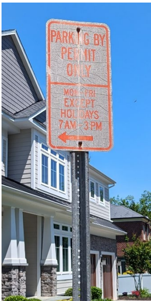
Figure 7 – Staff photo of parking permit signage at entrance to Jade Court NW