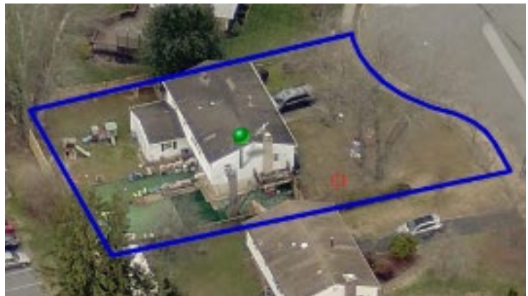
Figure 2 – 2023 aerial image of site

The applicant has included photos of both the interior and exterior of the property currently being used as a family day home (Attachment 5) As can be seen in the photos provided by the applicant and in Figure 2, the existing .25-acre lot contains the original existing single-family detached home, along with a fenced-in backyard and outdoor play area. The only notable change in the original constructed building on the site is an addition added to the rear of the home in 1981.