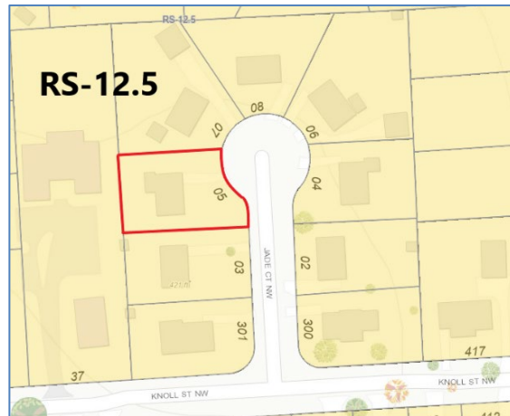
Figure 4 – Town of Vienna Zoning Map

As shown in Figure 4, the lot is zoned RS-12.5, Single-Family Detached Residential, Residential, Single-Unit, on the Town of Vienna Zoning Map. The RS-12.5 zone is one of the implementing zones within the Low-Density Residential Future Land Use designation. This zone primarily allows for single-family detached dwellings, along with associated accessory buildings, on lots no less than 12,500 square feet, or approximately 1/4 acre. Other uses may be allowed in the RS-12.5 zone as conditional uses, per Section 18-305, Accessory Uses Table, of the Zoning Ordinance. The subject site is surrounded by land also zoned RS-12.5.