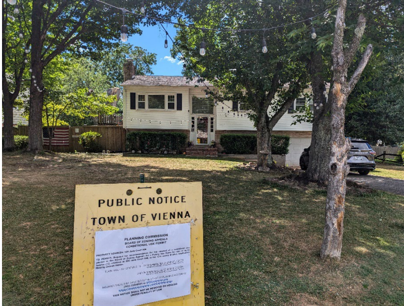
Figure 1 – Street view of front of home.