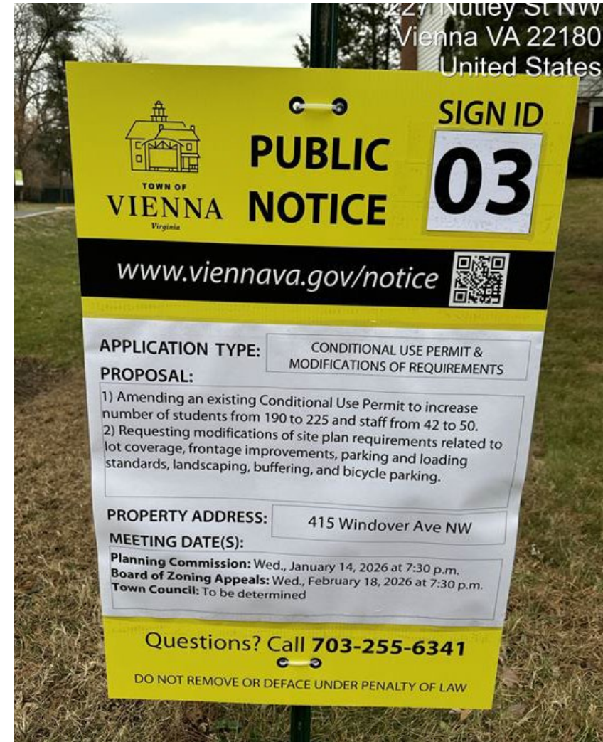
New Public Notice Sign