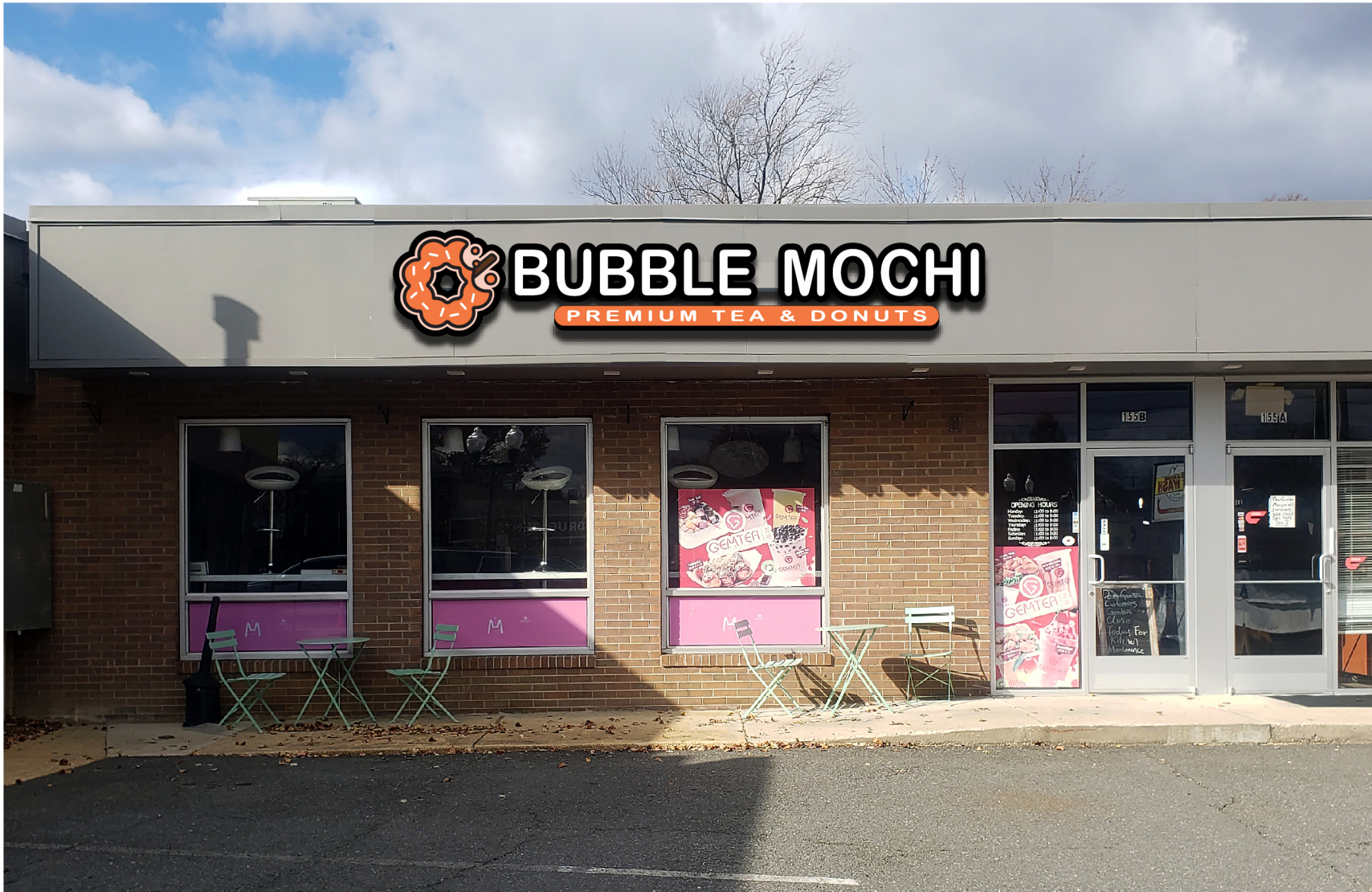
BUILDING FRONTAGE APPROXIMATE 31'