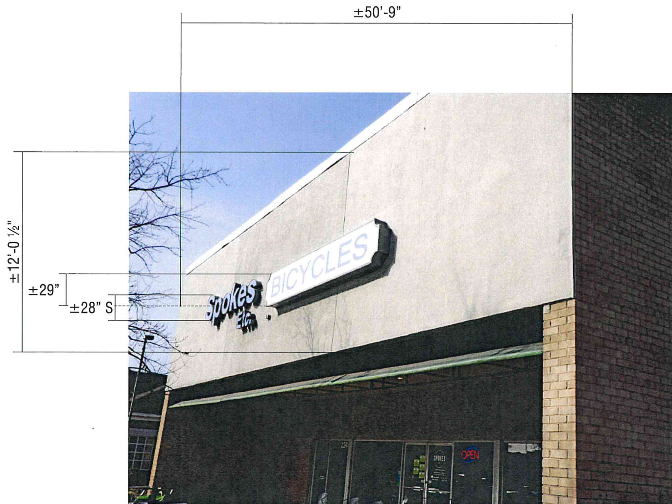
EXISTING CONDITIONS SCALE: 3/16"=1'-0"