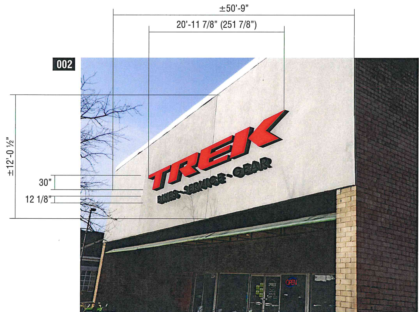
PROPOSED SIGNAGE SCALE: 3/16"=1'-0"

NOTE: AL PREVIOUS HOLES SEALED WATER TIGHT; WALL TO BE RESTORED TO LIKE NEW CONDITIONS AND ENTIRE ELEVATION TO BE PAINTED PANTONE 427C (GREY)