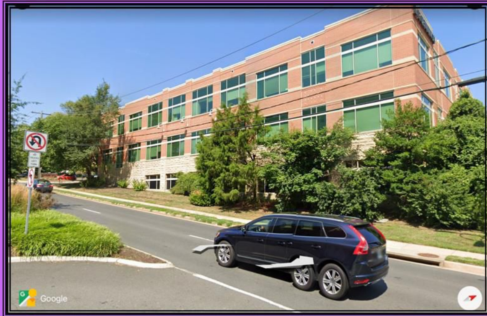
Vicinity Map 407 N Washington St.