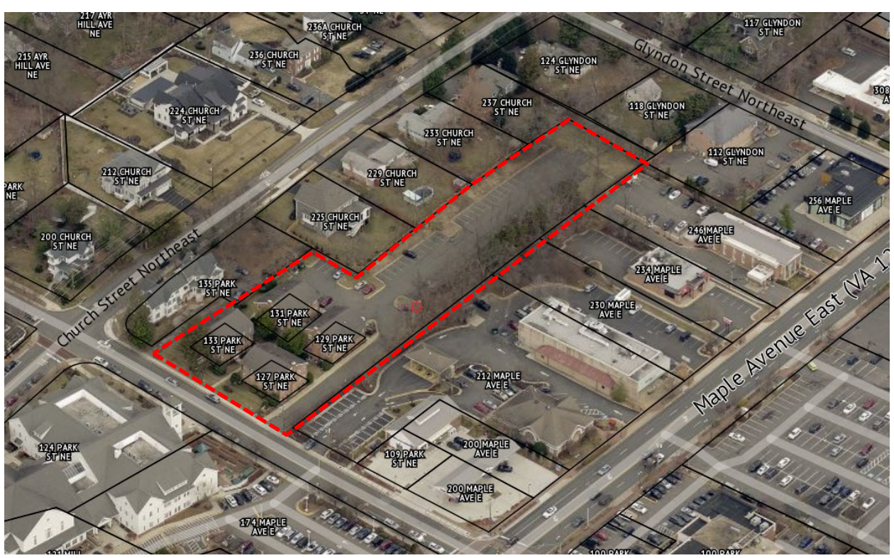
Figure 1 – Aerial image of site dated February 2022

The subject site, 127 to 133 Park Street NE, includes four separate three-story office buildings on a 72,173-square-foot site. The existing buildings were built in 1973 with approximately 24,000 square feet of gross floor area of office space. According to the original site plan, the site also contains 80 surface parking spaces. The site is currently zoned Transitional, which allows professional office uses. The site is surrounded by commercial properties facing Maple Avenue East and single-family residential properties along Church Street NE. The Vienna Presbyterian