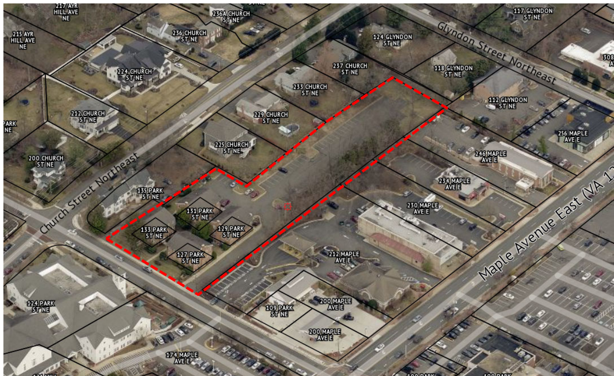
Figure 1 – Aerial image of site dated February 2022

This is an updated version of the staff report from November 14, 2022. Changes from that report are underlined.