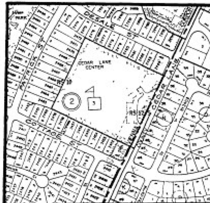
VICINITY MAP SCALE: 1"=500'