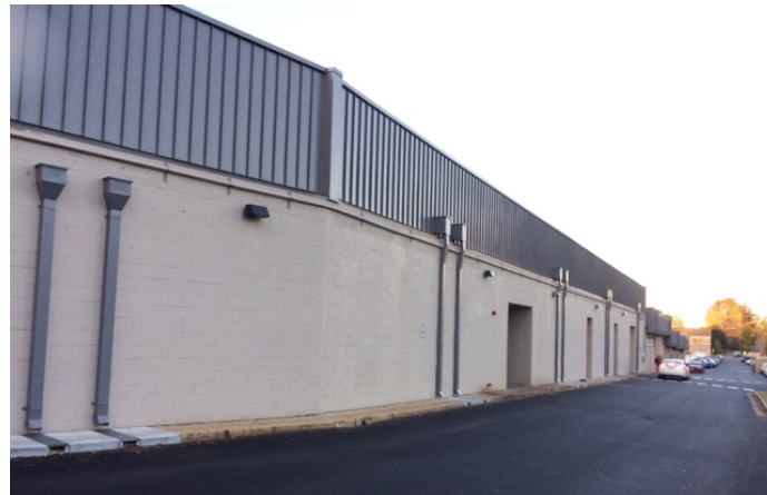
Back side of Rappaport Building – Vienna Shopping Center