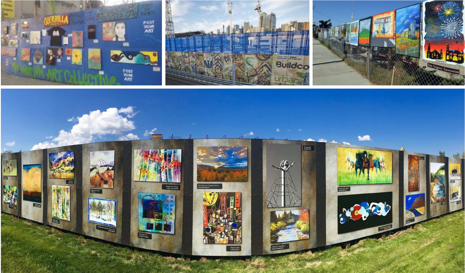
Construction wall exhibition