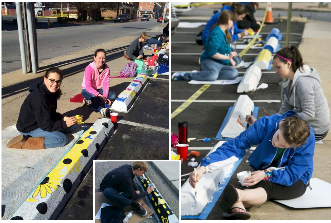
Bumper painting by local students