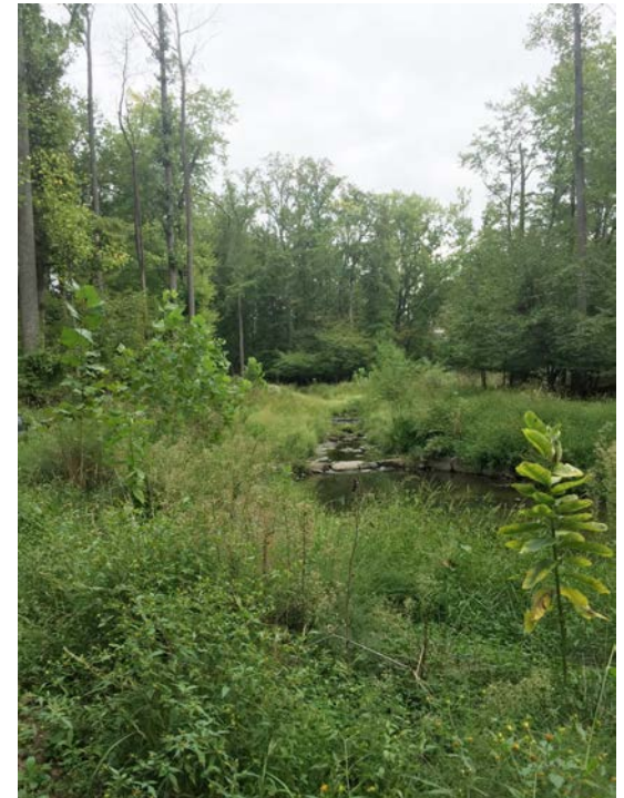
Wildwood Creek Park on W&O Trail