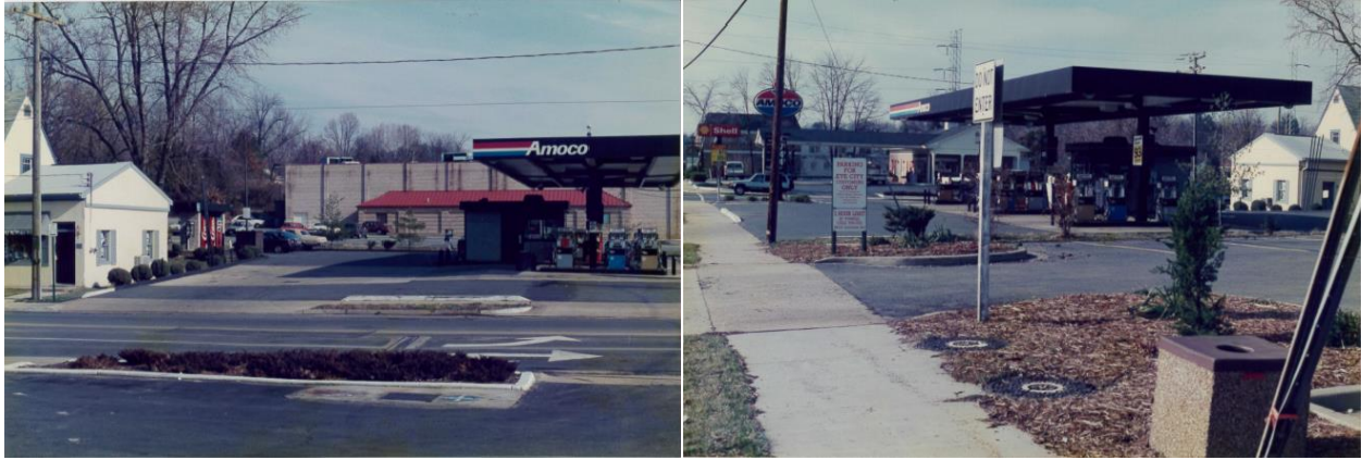
Figure 2 - Gas station site circa 1989