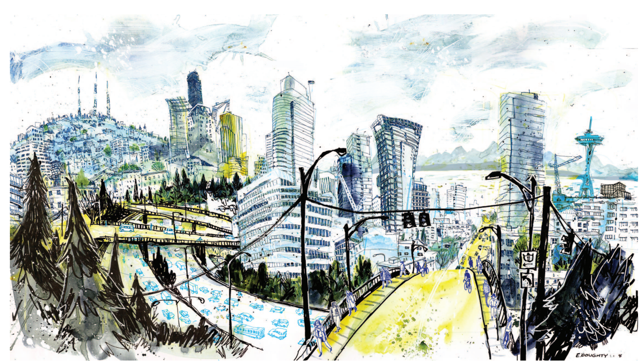
Illustration proposed for a large-scale exterior mural in downtown Seattle, which wanted a "gritty" look to the cityscape, which was expressed in watercolor textures and exaggerated perspective in line drawing. The project is pending.

March 2018 Size: 30"x18" (designed for 19'x48' wall)