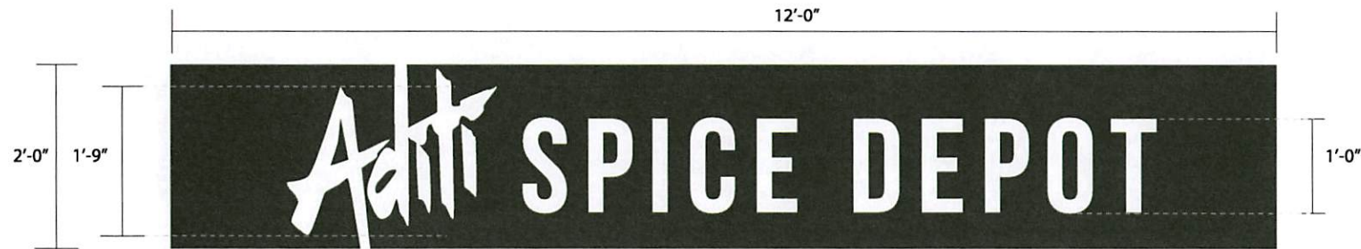
Existing Sign Face Panel