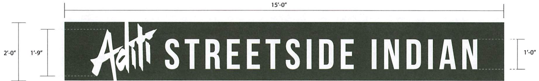
Existing Sign Face Panel