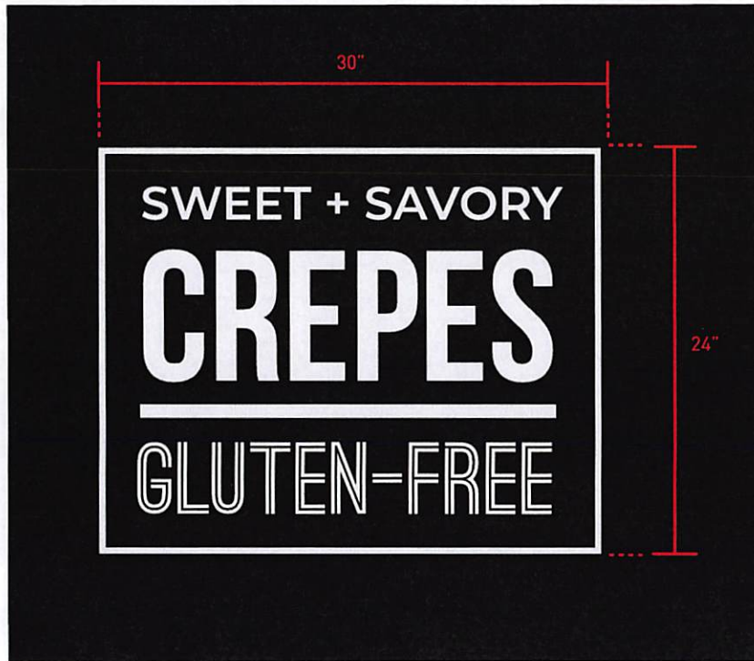
Left storefront window