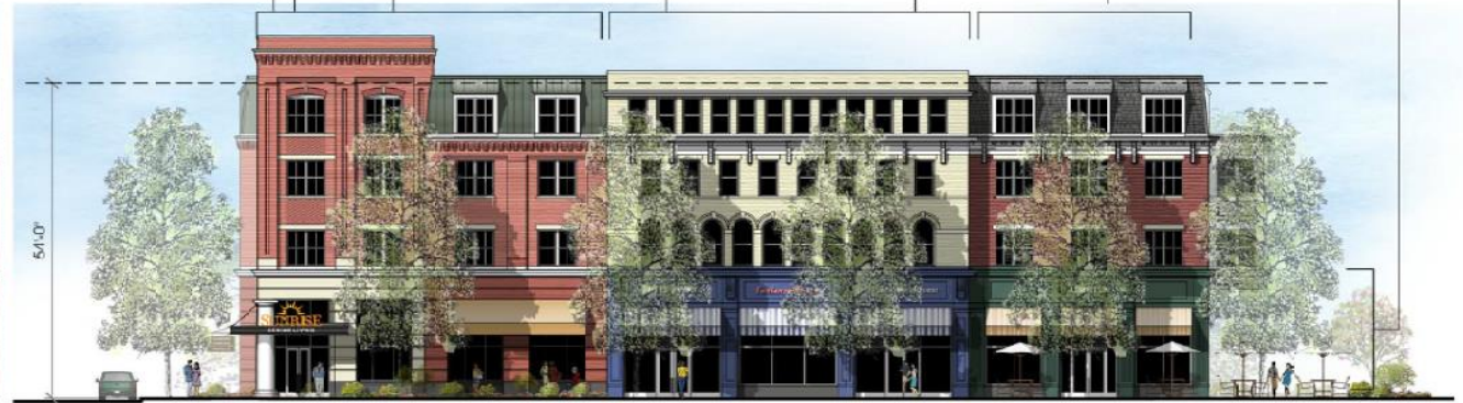
MAPLE AVENUE ELEVATION