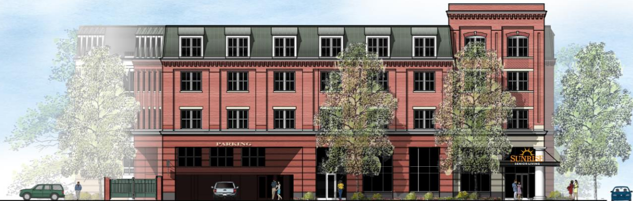
Center Street Elevation