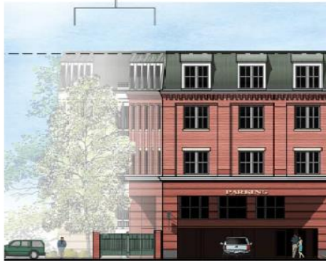
CENTER STREET ELEVATION