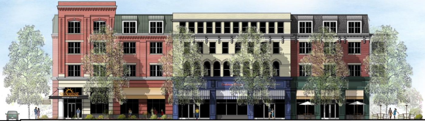
Maple Avenue Elevation