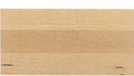
LifeScapes_Natural Maple_Smooth Hardwood