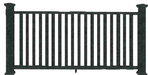
: Wood Railing)