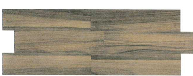
Marazzi_Sequoia Forest Rustic Brown_Wood Plate (8"x40")