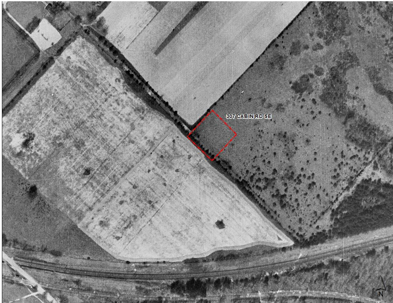
Figure 2 - 1937 Aerial Image

The applicant proposes to subdivide the one existing lot into two lots. Both lots will be accessed off Cabin Road Southeast. The applicant will make frontage improvements, including a standard five-foot sidewalk, a six-and-a-half-foot planting strip, and curb and gutter in front of the two proposed lots. Staff notes that sidewalks do not currently exist on either side of the 300 block of Cabin Road Southeast, while curb and gutter lines a majority, but not the entire block.