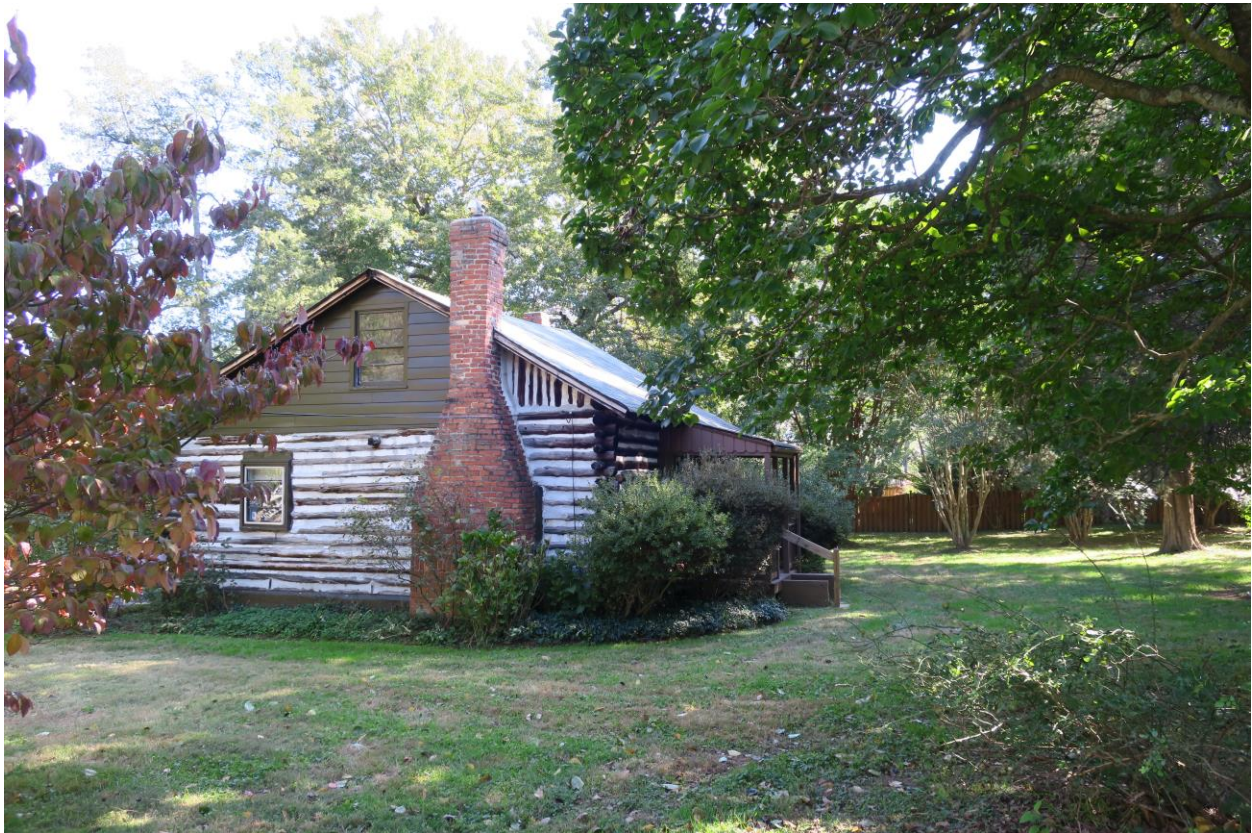
Figure 1 – 307 Cabin Road Southeast

Recommendation to the Town Council on a final plat for the Addition to the Jennie Lynn Division to subdivide one lot into two lots on property located at 307 Cabin Road SE in the RS-10, Single-Family Detached Residential zone. Application filed by Ted Britt, P.E. of Tri-Tek Engineering. (Recommended new address of 305 Cabin Road SE in addition to existing address)