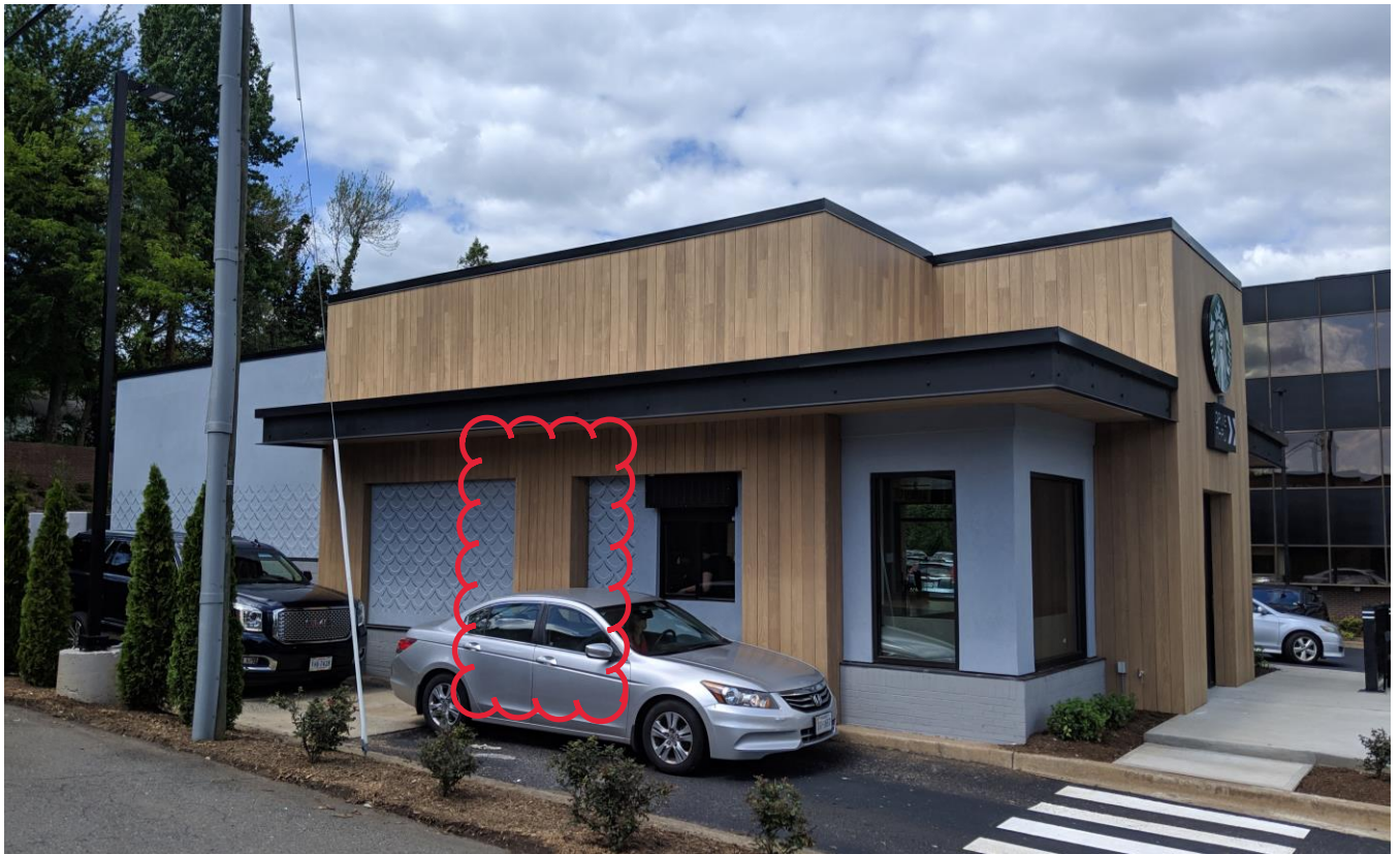
Figure 2 - Revised South Elevation