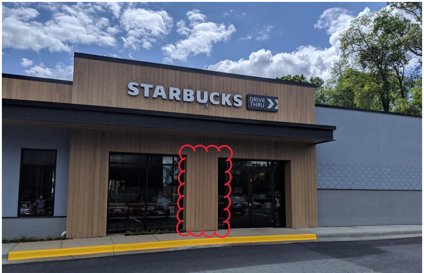
Figure 4 - Revised North Elevation