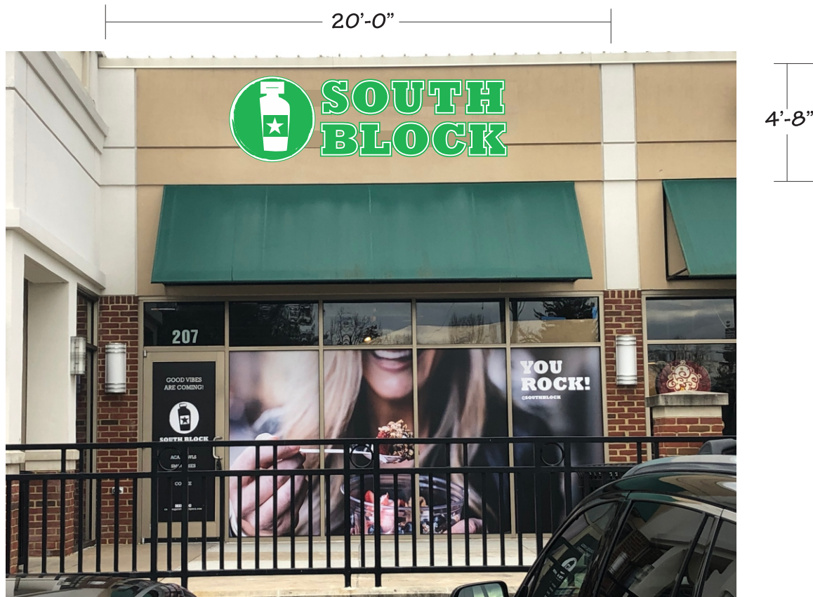
SIGN INSTALLED OVER STOREFRONT CENTERED LEFT TO RIGHT AND 2" HIGH OF CENTER TOP TO BOTTOM