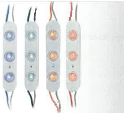
Street Fighter Colors

( https://www.p-led.com/products/street-fighter-colors/ )