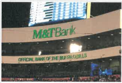
( https://cdn.p-led.com/product-street-fighter-middleweight-example.jpg )