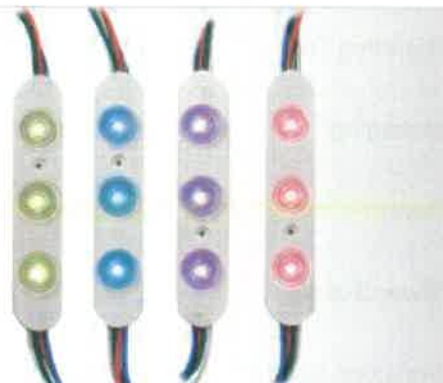
Street Fighter RGB

( https://www.p-led.com/products/street-fighter-colors/ )