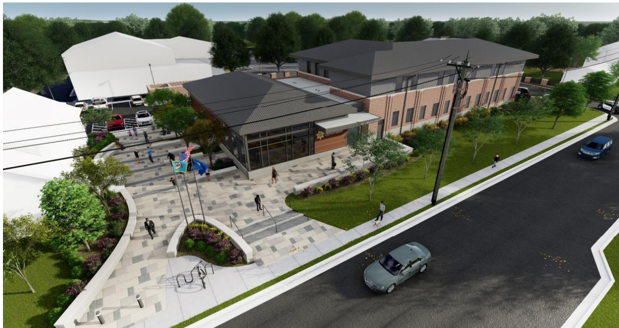
Figure 3 - Rendering of the proposed police station and public plaza

The proposal for the new two-story police station includes almost 30,000 square feet of gross floor area. The amount of floor area needed was determined by the needs assessment completed in 2013 as well as by consultations with Dewberry. The building will include a fitness room, records