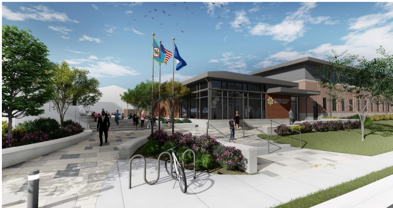
Figure 4 - Rendering of the public plaza, from Locust Street Southwest

In addition to the new building, a public plaza is proposed between the new building and the Bowman House. The plaza will include a mixture of landscaping, hardscaping, and seating walls and will incorporate Crime Prevention through Environmental Design (CPTED) site design features. The plaza will be designed to encourage public activity and offer a comfortable atmosphere.