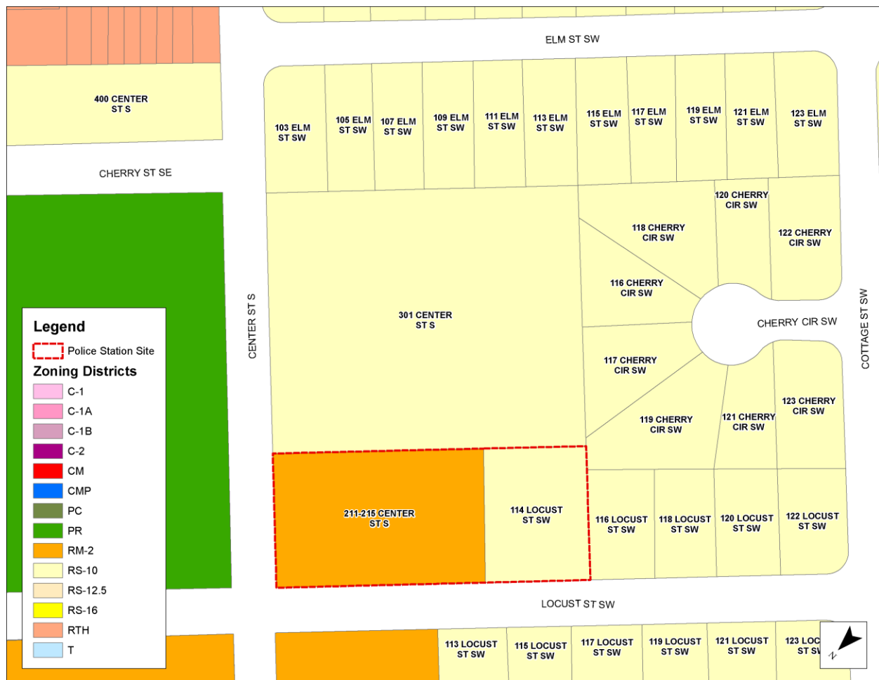
Figure 1 - Zoning map with location of subject properties outlined in red

The Bowman House was originally built circa 1890 and functioned as a two-room schoolhouse. It was relocated from across Center Street South to its current location and now serves as the Town's pottery and art studio. The Bowman House will remain as-is during the construction of the new police station.