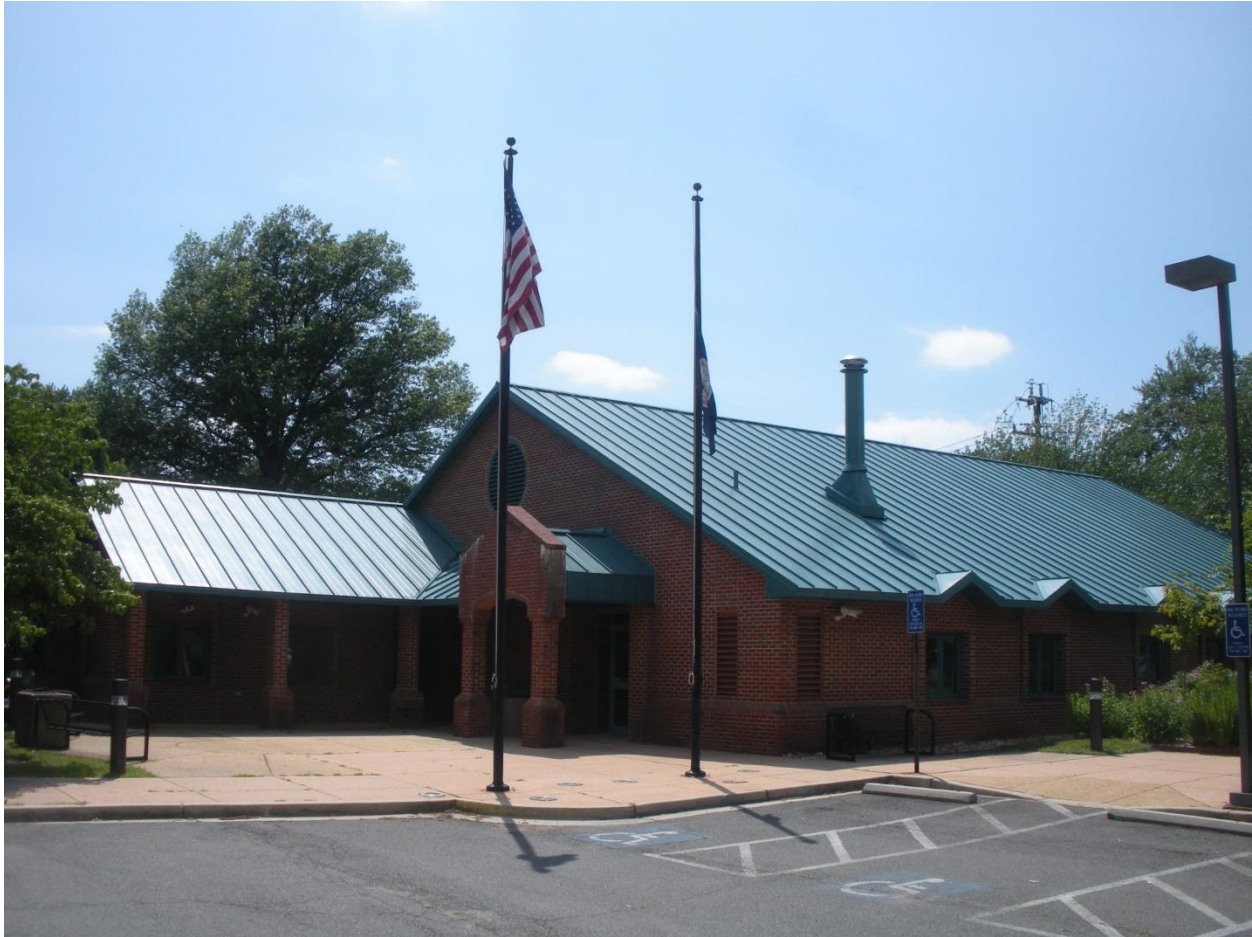
Figure 2 - Existing police station building, built in 1994

In 2007, due to expanding operations and increased technology requirements, the Criminal Investigations Section was relocated to Town Hall, where they currently occupy 1,800 square feet.