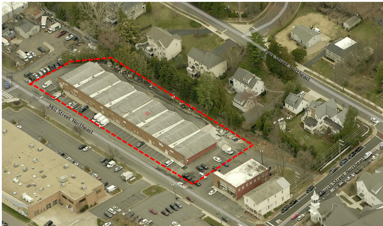
Figure 1 - Aerial photograph of existing building and site

Request for approval of a landscape plan associated with the proposed new self-storage building, located at 223-241 Mill Street NE, in the CM Limited Industrial zoning district.