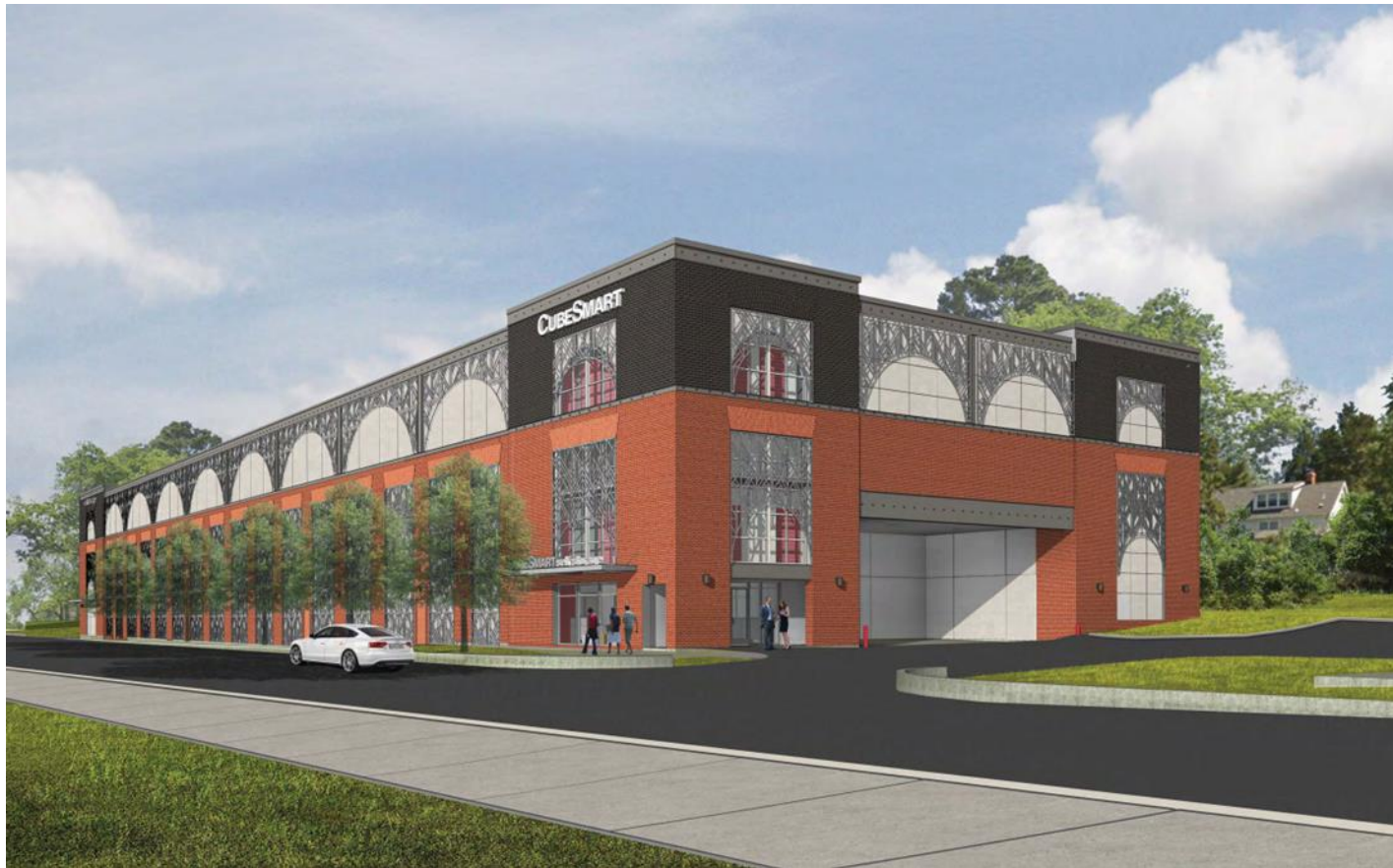
Figure 3 - Rendering of proposed self-storage building

The applicant is proposing a four-story self-storage facility with 131,084 square feet of gross floor area, including a 1,168 square foot office area. The applicants anticipate 1,150 storage units, to be located on all four floors. There will be one employee working at the building during maximum shift. The self-storage facility will be operated by CubeSmart Self Storage.