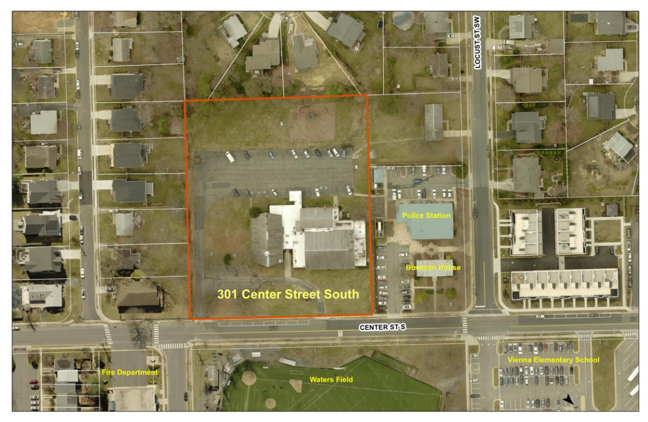
Figure 1 – 301 Center Street South Context Map

The institutional property located at 301 Center Street South, previously owned and operated by the Faith Baptist Church, was purchased by the Town in September 2020. The property was purchased for public uses but is not designated as such in the Comprehensive Plan that was last amended on February 2, 2020. Per Section 15.2-2232 of the Code of Virginia, any public building or use shall be shown on the Comprehensive Plan. At their September 14, 2020 regular meeting, the Town Council set a public hearing for October 5, 2020 to consider amending the Comprehensive Plan for the purpose of designating these properties for public use and referred the matter of amending the Comprehensive Plan to the Planning Commission. The Planning Commission will hold a public hearing and make a recommendation regarding the amendments to Town Council at a special meeting on September 30, 2020.